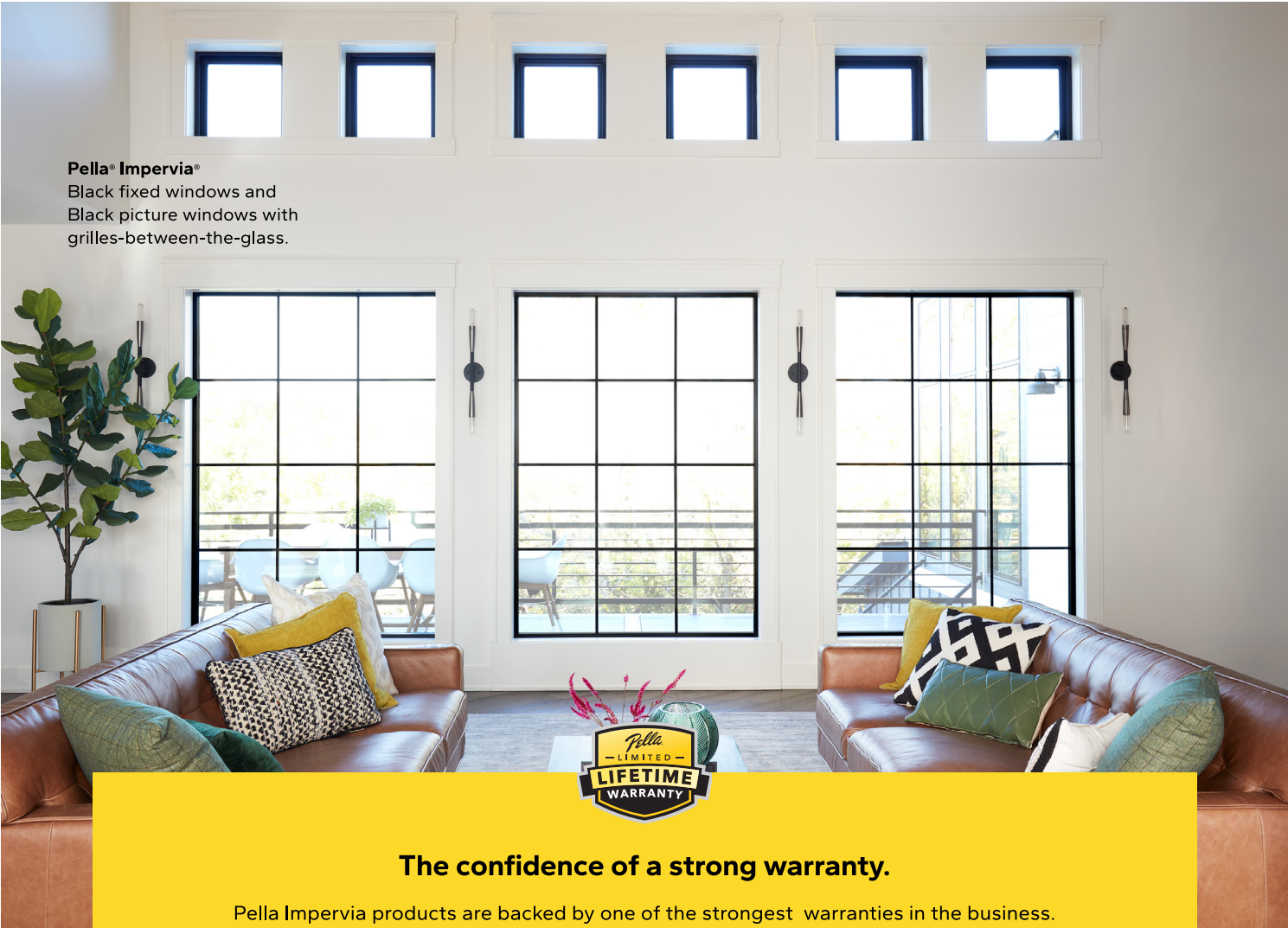
Pella® Impervia® Black fixed windows and Black picture windows with grilles-between-the-glass.