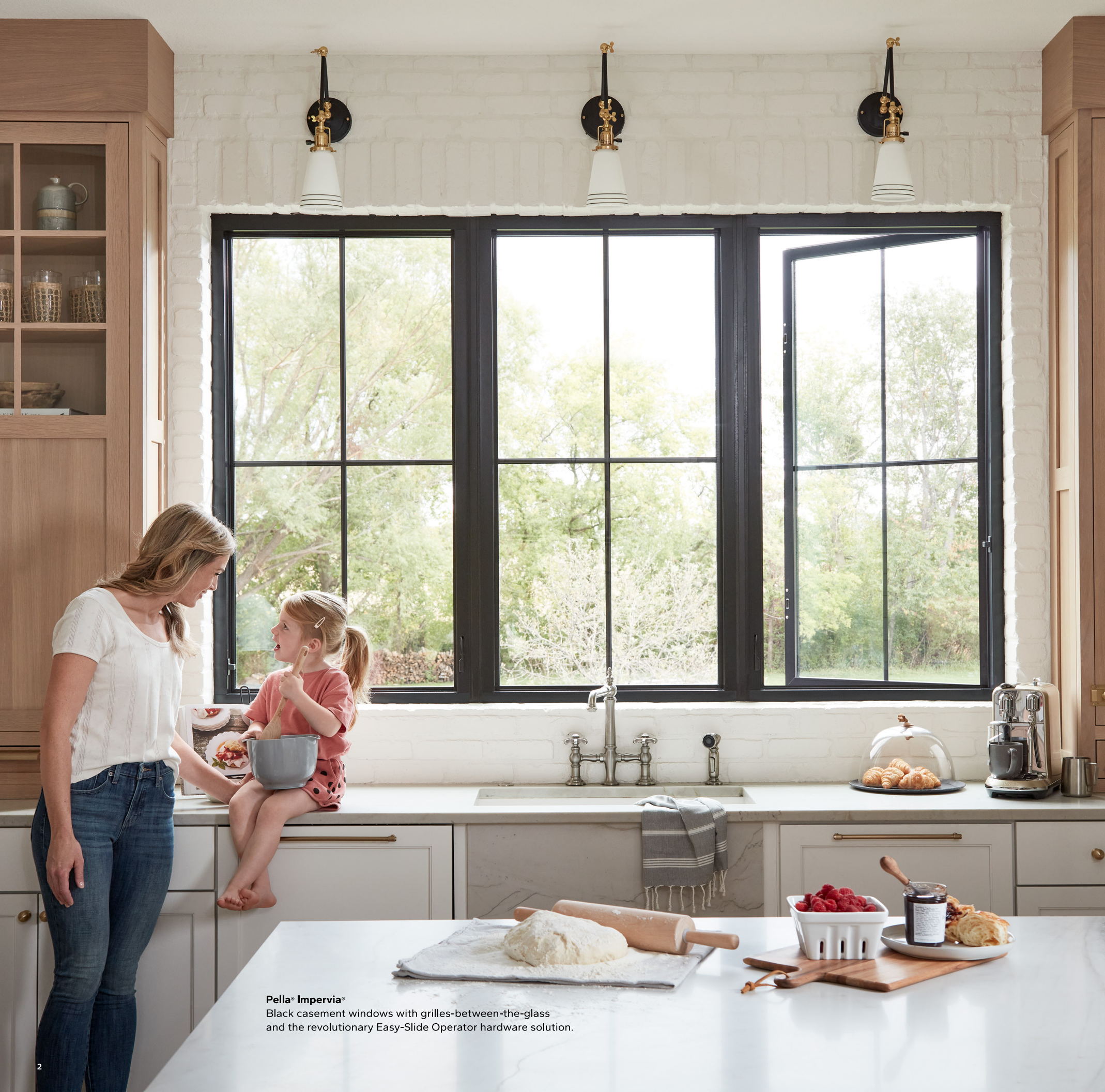
Pella® Impervia® Black casement windows with grilles-between-the-glass and the revolutionary Easy-Slide Operator hardware solution.