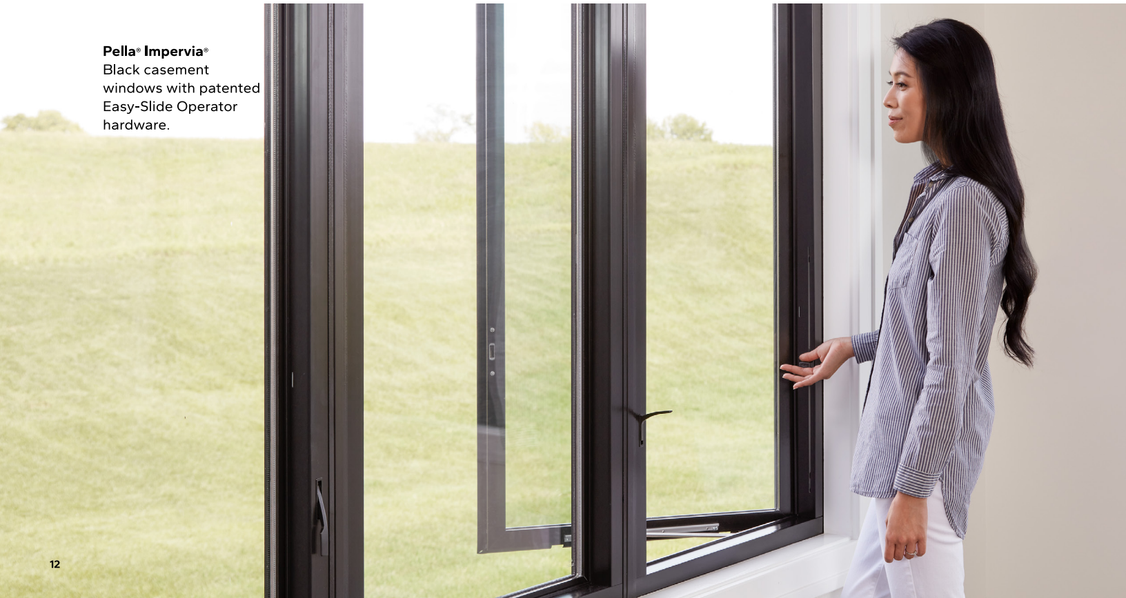
Pella® Impervia® Black casement windows with patented Easy-Slide Operator hardware.