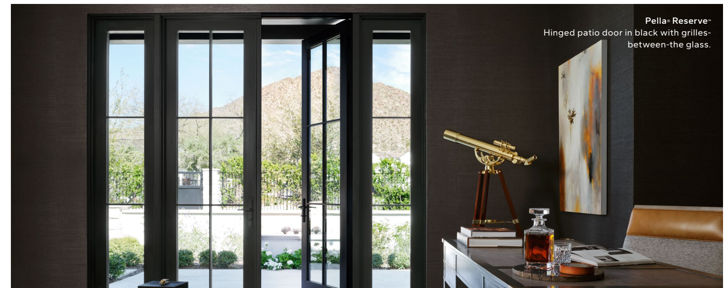
Pella® Reserve™ Hinged patio door in black with grilles-between-the-glass.

Warranty information is correct as of 3/1/2024. Warranties are subject to change and buyers are subject to the current warranty at time of sale. See pella.com/warranty for all current and historical warranties as well as additional details, limitations, and exclusions.