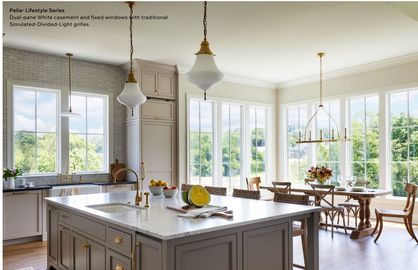
Pella® Lifestyle Series Dual-pane White casement and fixed windows with traditional Simulated-Divided-Light grilles.