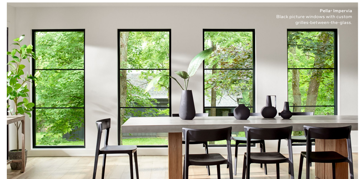
Pella® Impervia Black picture windows with custom grilles-between-the-glass.

Warranty information is correct as of 3/1/2024. Warranties are subject to change and buyers are subject to the current warranty at time of sale. See pella.com/warranty for all current and historical warranties as well as additional details, limitations, and exclusions.