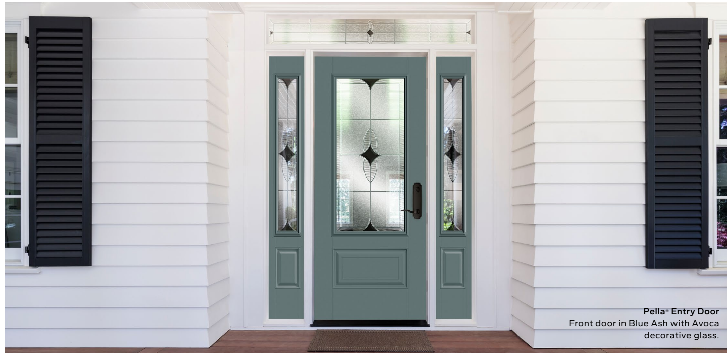
Pella® Entry Door Front door in Blue Ash with Avoca decorative glass.