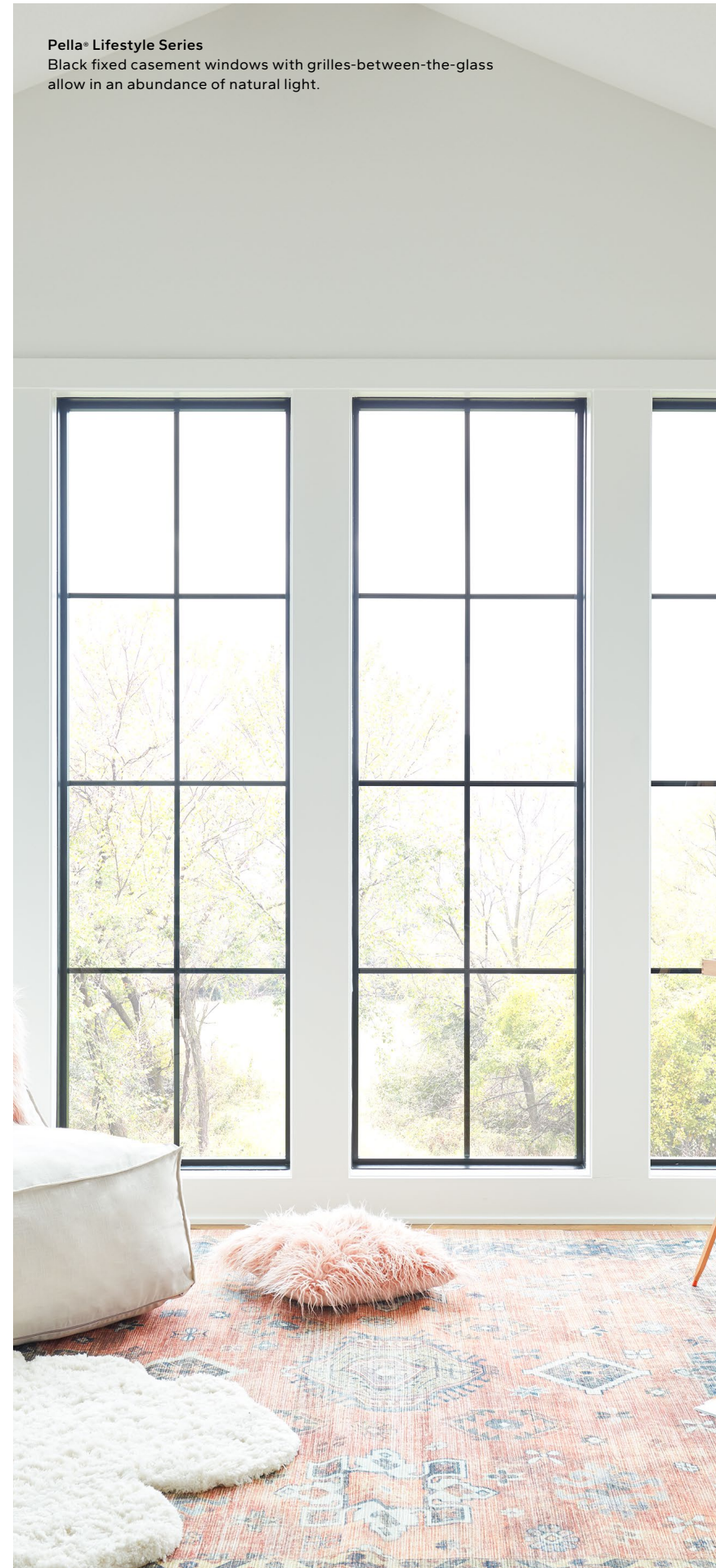
Pella® Lifestyle Series Black fixed casement windows with grilles-between-the-glass allow in an abundance of natural light.

Pella windows provide the highest value to homeowners.*