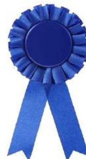
Top Poster Awardee