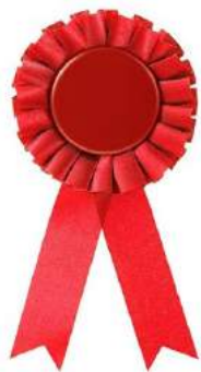
Top Poster Presentation Awardee

Two awardees per group will be selected by an Early Career Investigator (ECI) Member and Volunteer for Top Poster Presentation and Top Poster. The award with the corresponding ribbon will be placed on their poster board during the reception.