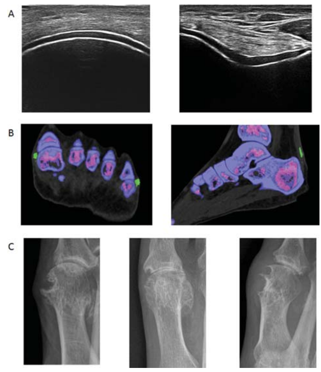
Figure 3. Examples of imaging features included in the classification criteria. A, Double-contour sign seen on ultrasonography. Left panel shows a longitudinal ultrasound image of the femoral articular cartilage; right panel shows a transverse ultrasound image of the femoral articular cartilage. Both images show hyperechoic enhancement over the surface of the hyaline cartilage (images kindly provided by Dr. Esperanza Naredo, Hospital Universitario Gregorio Marañon, Madrid, Spain). B, Urate deposition seen on dual-energy computed tomography. Left panel shows urate deposition at the first and fifth metatarsophalangeal joints; right panel shows urate deposition within the Achilles tendon. C, Erosion, defined as a cortical break with sclerotic margin and overhanging edge, seen on conventional radiography of the first metatarsophalangeal joint.

geal joint, ankle, or midfoot involvement as part of a polyarticular presentation, though possible in gout, was not specific enough for gout since that pattern could be seen commonly in other disorders such as rheumatoid arthritis. The time course of symptomatic episodes was to be considered irrespective of antiinflammatory treatment. For clinical tophus, a precise definition in terms of appearance and location was developed to assist in differentiation from other subcutaneous nodules that may be confused with tophi. Examples of clinically evident tophi are provided in Figure 2. Serum urate was considered a mandatory element of the classification criteria scoring system (i.e., the score cannot be computed without a serum urate value). For the synovial fluid domain, the fluid must be aspirated from a symptomatic (ever) joint or bursa, and assessed by a trained observer.