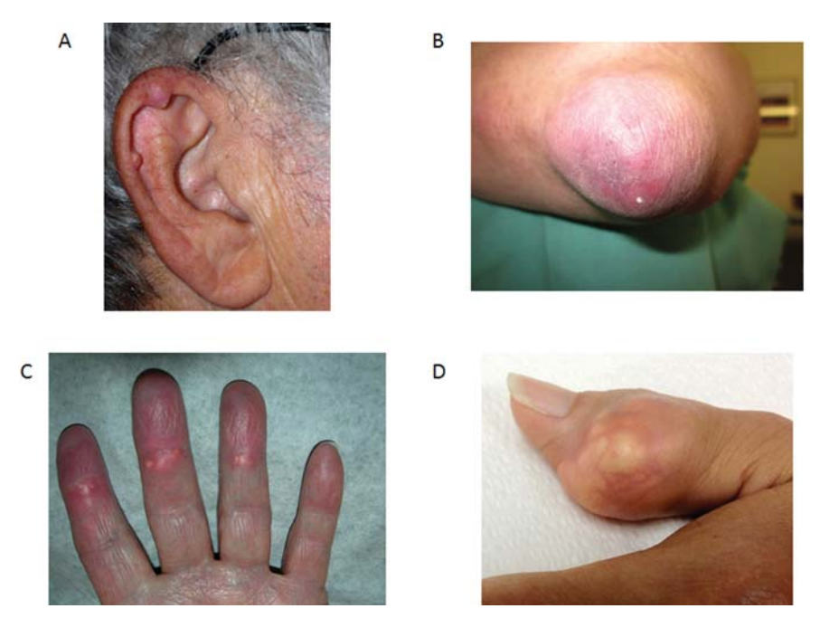
Figure 2. Examples of tophus. The tophus is defined as a draining or chalk-like subcutaneous nodule under transparent skin, often with overlying vascularity. Typical locations are the ear (A), the elbow (olecranon bursa) (B), and the finger pulps (C and D). Note the overlying vascularity in D.

comorbidities in the definition of gout would preclude future studies evaluating their association with gout.