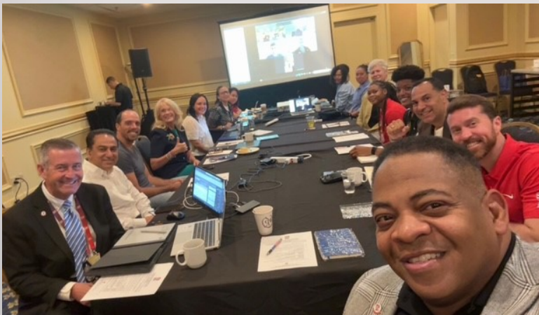
Pictured above are board members, staff and guest presenters from STING at the June 20, 2025 board meeting in Las Vegas.

The Board meets next virtually on August 28th.