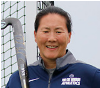
PSU HARRISBURG ATHLETICS