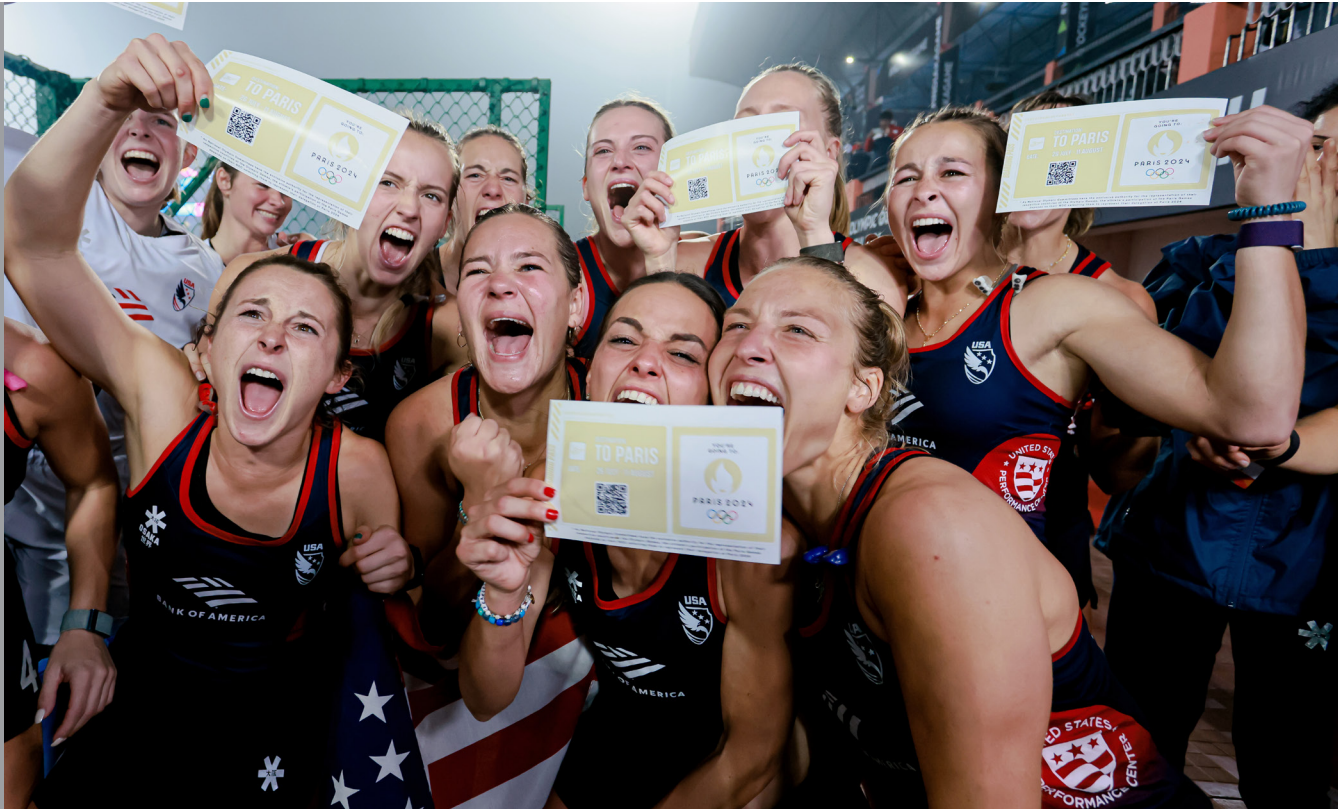
WORLD SPORT PICS