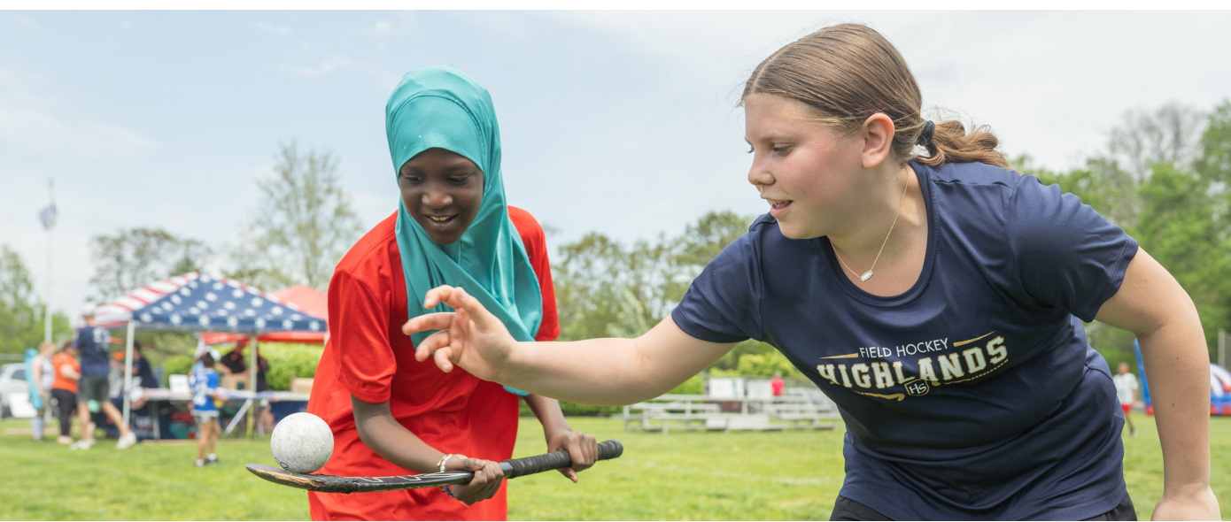
KENTUCKY STATE CHAPTER