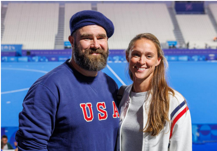
WORLD SPORT PICS