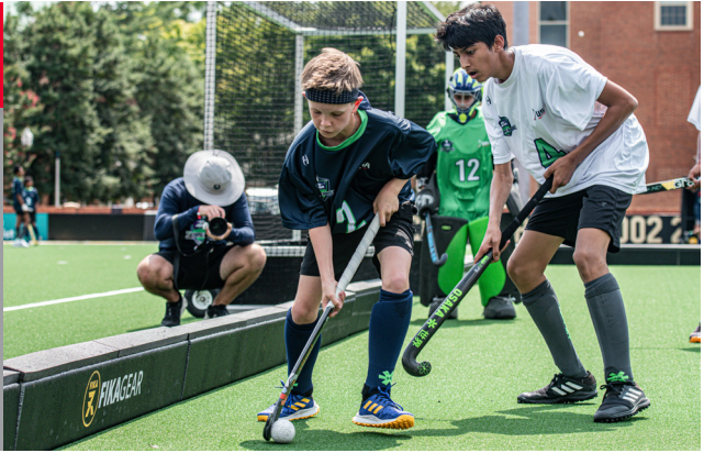
AMIAAN SPORTS PICS

July 29 - August 1, 2024 Wake Forest University Winston Salem, N.C. U-16 Boys & U-16 Girls Boys Athletes: 45 Girls Athletes: 108