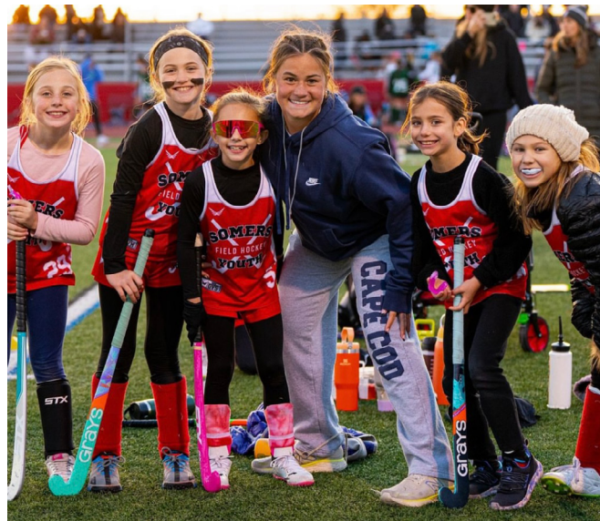
SOMERS YOUTH FIELD HOCKEY