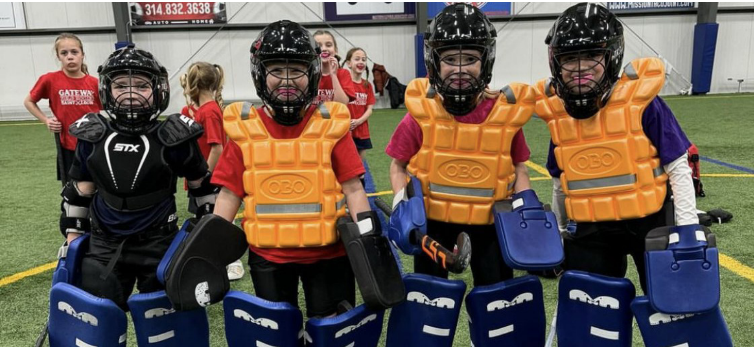
GATEWAY FIELD HOCKEY

USA Field Hockey’s vision, as defined in the 2023-2028 Strategic Plan, is for field hockey to thrive in the United States. Growing the game and driving local, regional and national opportunities for all to play, coach, umpire, watch and enjoy the sport, both recreationally and competitively, is essential to achieving this vision.