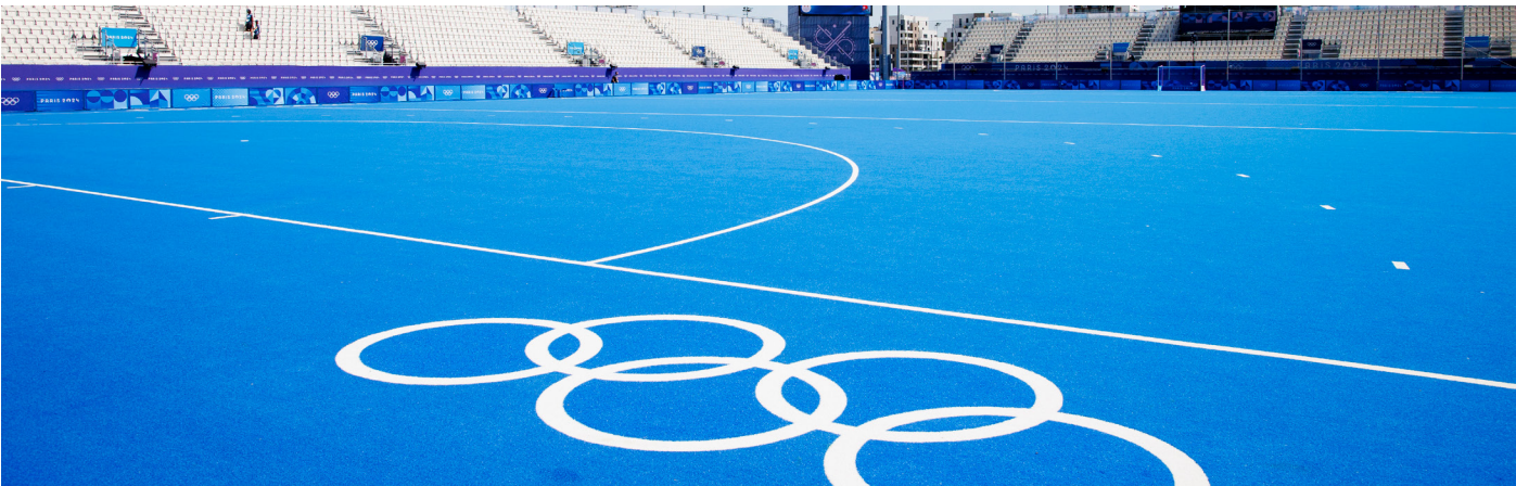
WORLD SPORT PICS