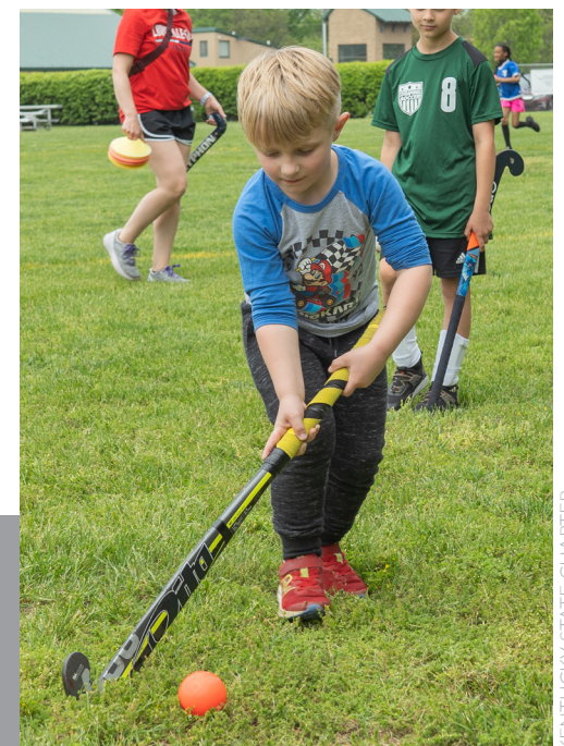
KENTUCKY STATE CHAPTER

USA Field Hockey promotes field hockey to youth multi-sport organizations such as Parks and Recreation Departments, YMCAs, camps and School physical education, and more. The Sport Development Department continues to attend the Project Play Summit each year to help organizations who work with youth add field hockey opportunities.