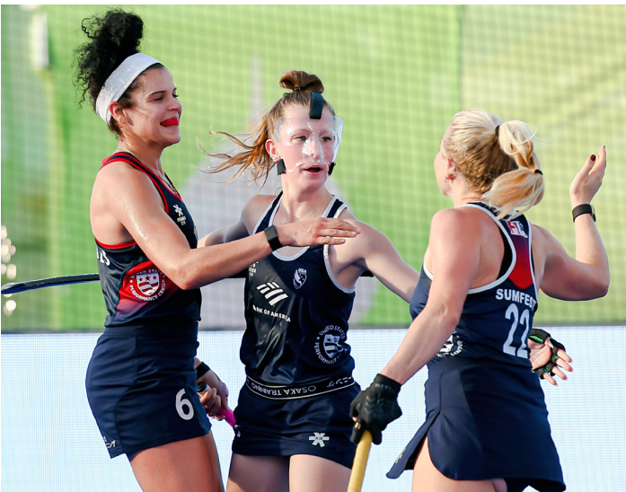
WORLD SPORT PICS