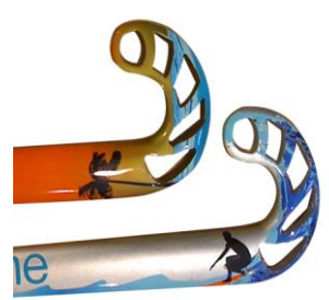
Beach Hockey Stick