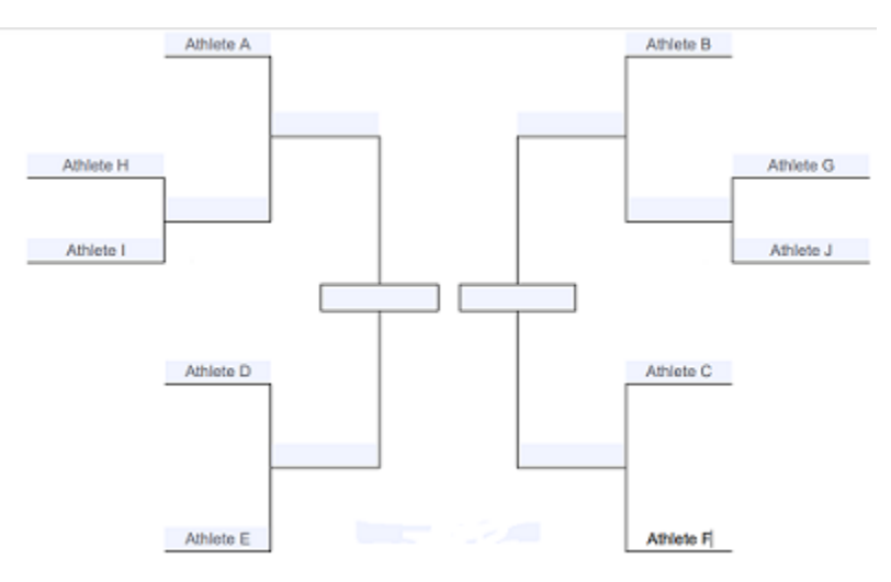
*Under 30 and Under 40 recognized individual black belt divisions

2.5. If a Single Elimination Bracket is used, each athlete will be placed in the bracket based on their points ranking.