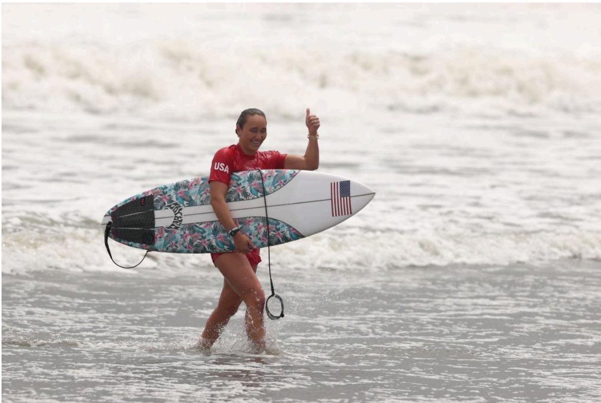
Carissa Moore competes at the 2020 Tokyo Olympic Games.