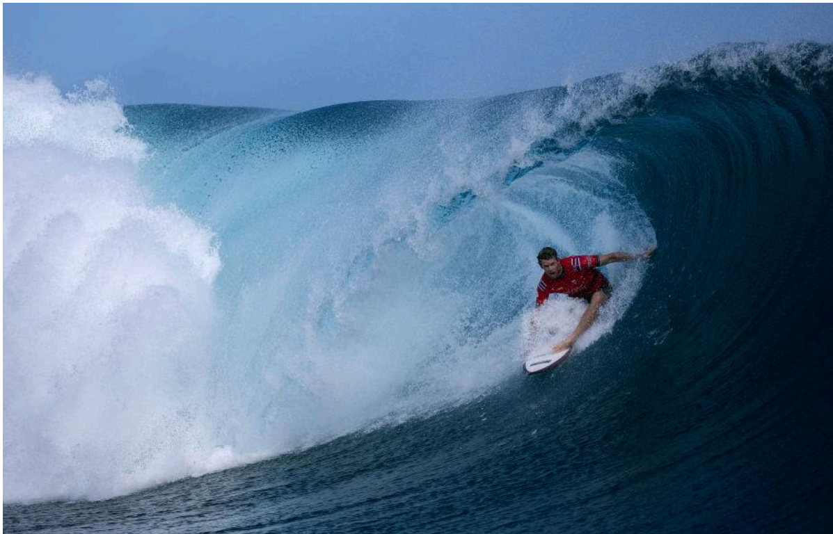
John John Florence competes in the 2024 Tahiti Pro in Teahupo'o.