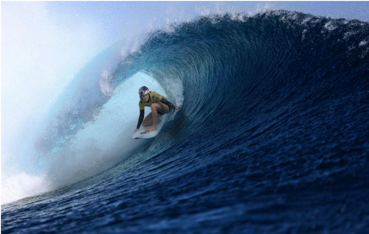
Caity Simmers competes in the 2024 Tahiti Pro in Teahupo'o.