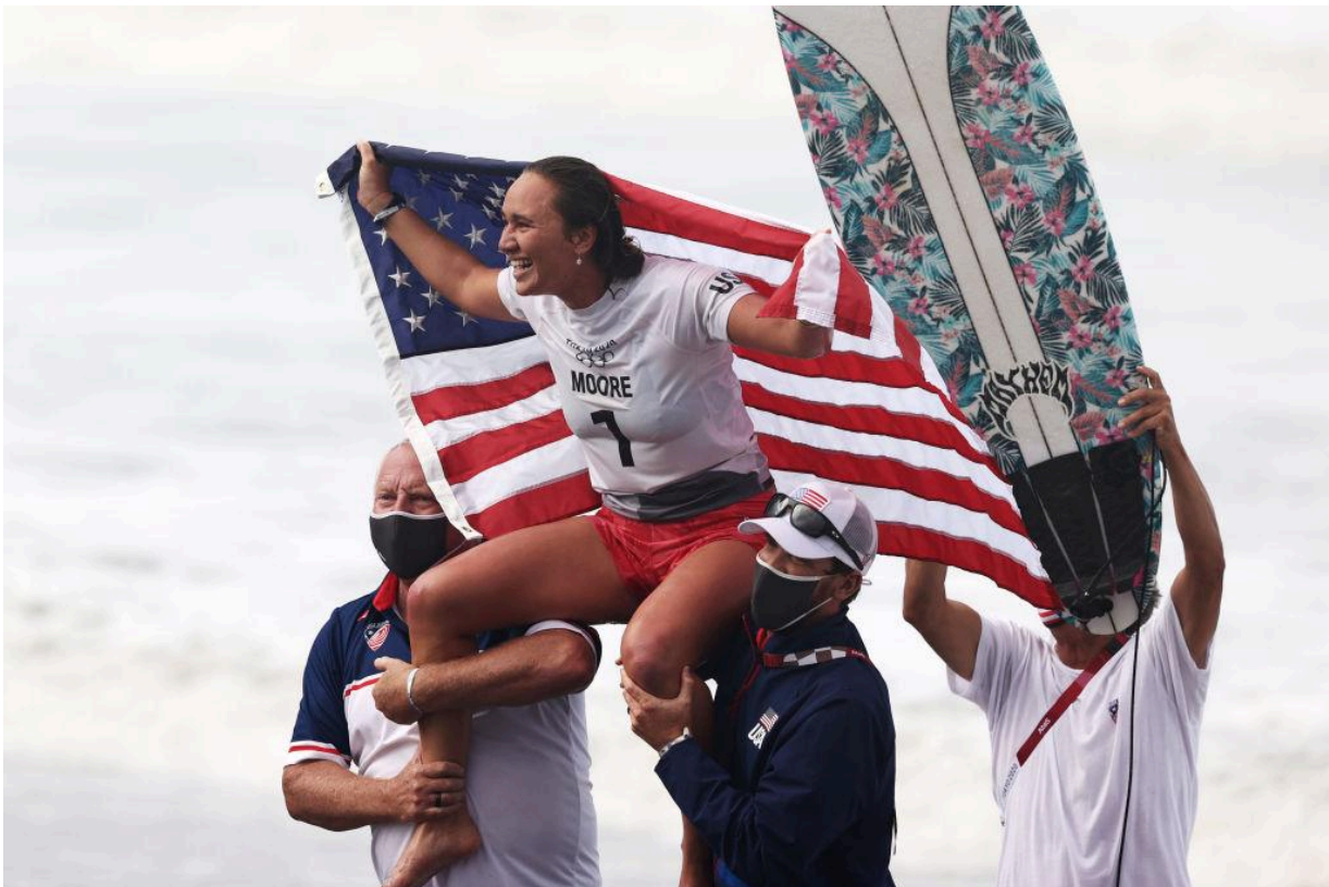
Carissa Moore after her historic win at the Tokyo 2020 Olympic Games