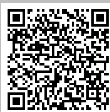
Online Reporting Form

Bobby Click (747) 688-SAFE athletesafetyusspeedskating@gmail.com