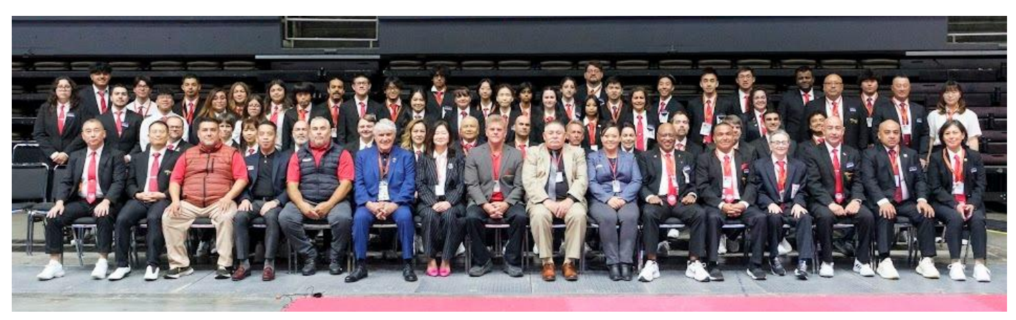
2024 CUTA States Referees Fresno, CA