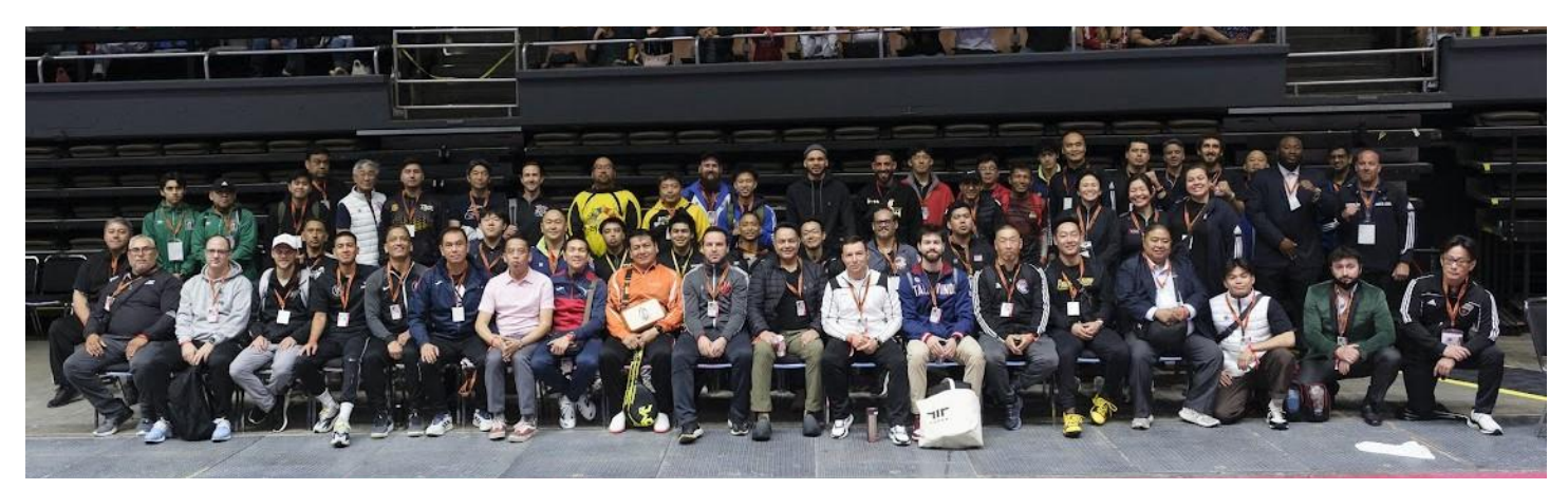
2024 CUTA States Coaches Fresno, CA