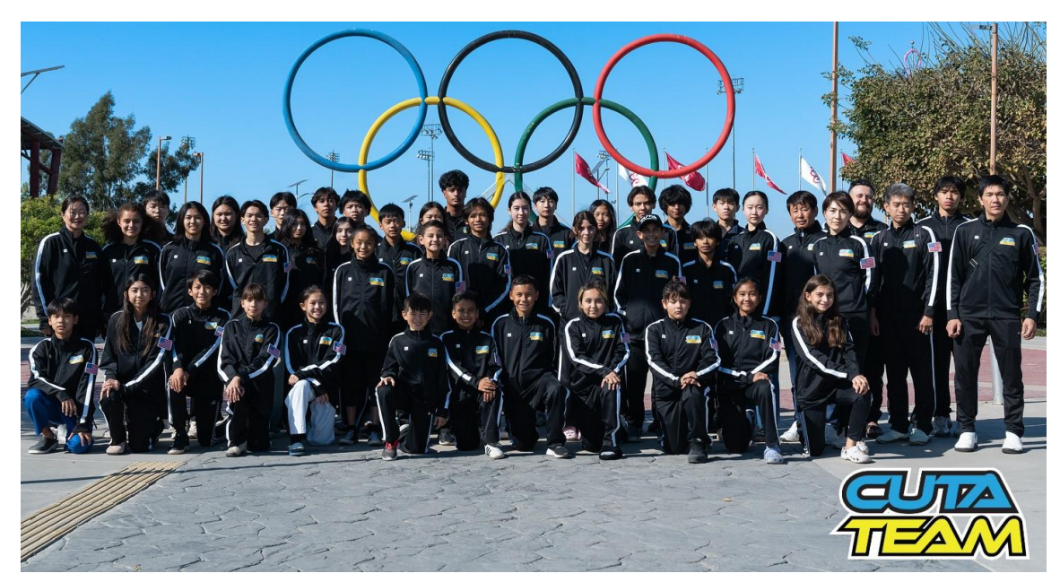
2024 Binationals, Tijuana, Baja California, Mexico CUTA Youth, Cadet & Junior Team, Took First Place