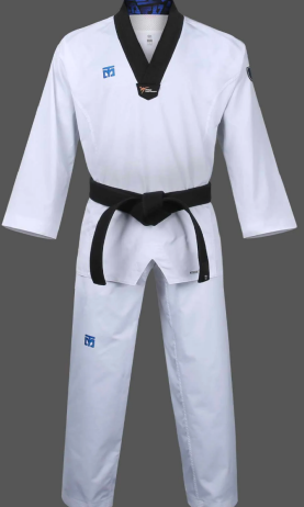
Black V-Neck Black Belts