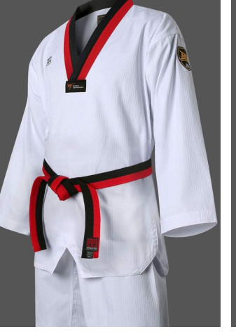
Poom V-Neck Black Belts U14