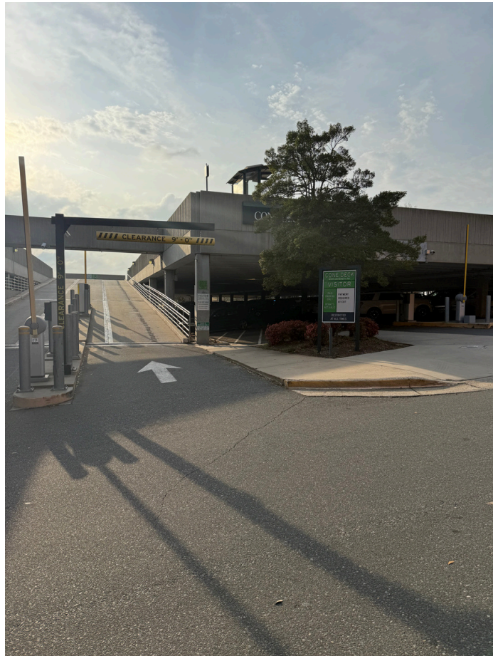
Cone Deck Rooftop