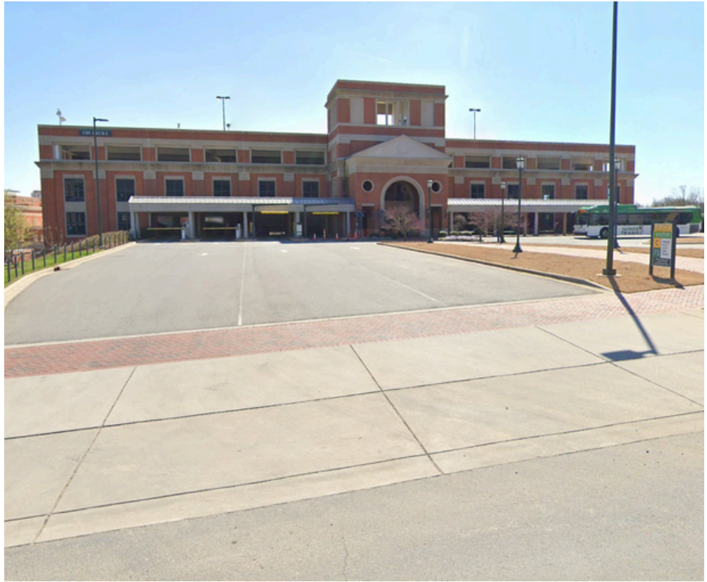
CRI Deck Visitor Parking