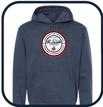
Unisex Hoodie $75 sizes XS-XXL