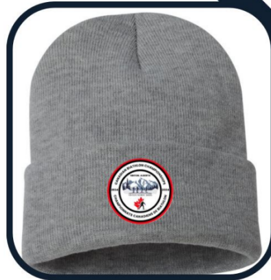
Toque $35 Black or Grey