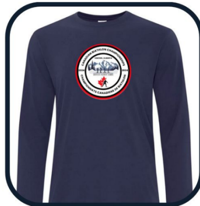
Men's Longsleeve $55 sizes S-XXL

Merchandise will be available for pickup in Hinton on Training Day