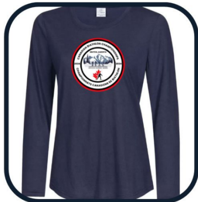
Women's Longsleeve $55 sizes XS-XL