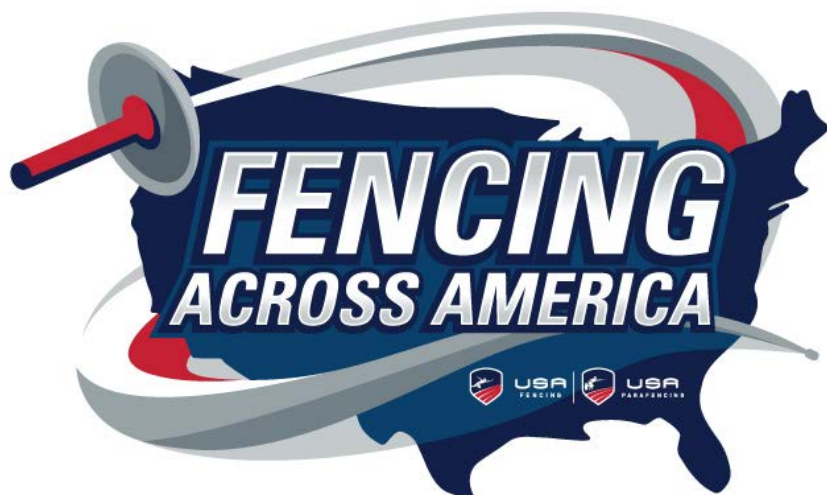
Logo on light background