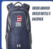
UNDER ARMOUR UNISEX HUSTLE II BACKPACK