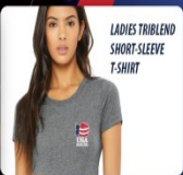
LADIES TRIBLEND SHORT-SLEEVE T-SHIRT

Check out the latest releases from Athlete Performance Solutions in the Nike HyperKO 2! Step into the ring with confidence and style.