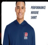
PERFORMANCE HOODIE SHIRT