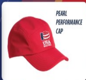
PEARL PERFORMANCE CAP

WWW.SHOPUSABOXING.ORG IS YOUR ONE STOP SHOP FOR THE BEST USA BOXING GEAR.