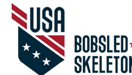
Athlete Support Table