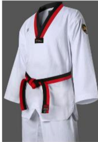
Poom V-Neck Black Belts U14