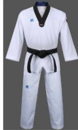
Black V-Neck Black Belts