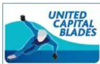
United Capital Blades Medium Club of the Year