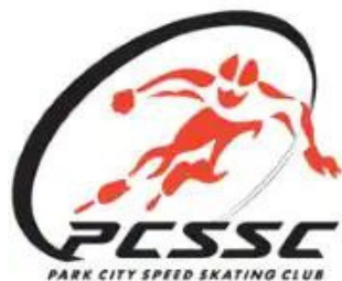
PC Speed Skating Club Small Club of the Year

USS Clubs participated in the USS Club of the Year award process where they were rated in Membership, Administration, Training & Safety, Outreach and Competition. On average, the participating clubs have a retention rate of 74%!