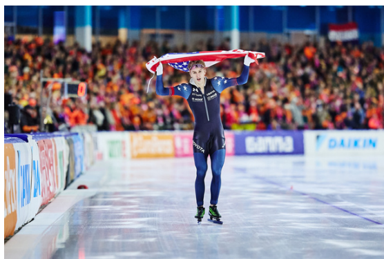
Jordan Stolz Eric Heiden Award