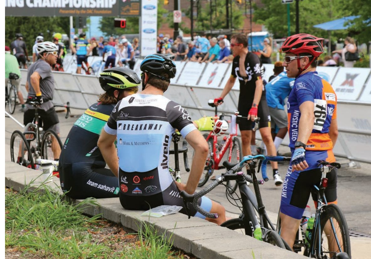
Race day was a great scene in and around Beacon Park, and along Grand River Avenue, with nearly 400 racers, their teams, families and friends enjoying excellent competition, a friendly atmosphere and lots to do around this year's Detroit Cycling Championship race course.