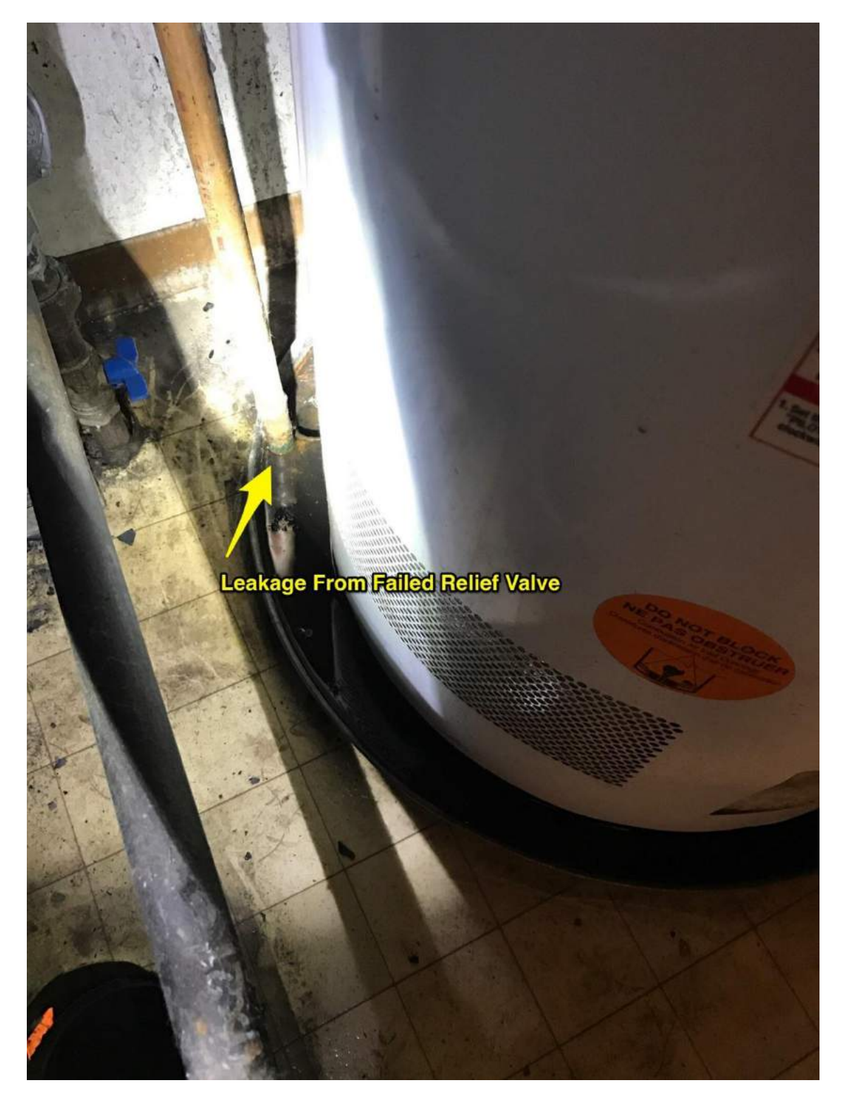
Figure 5: Discharge of relief piping showing leakage.