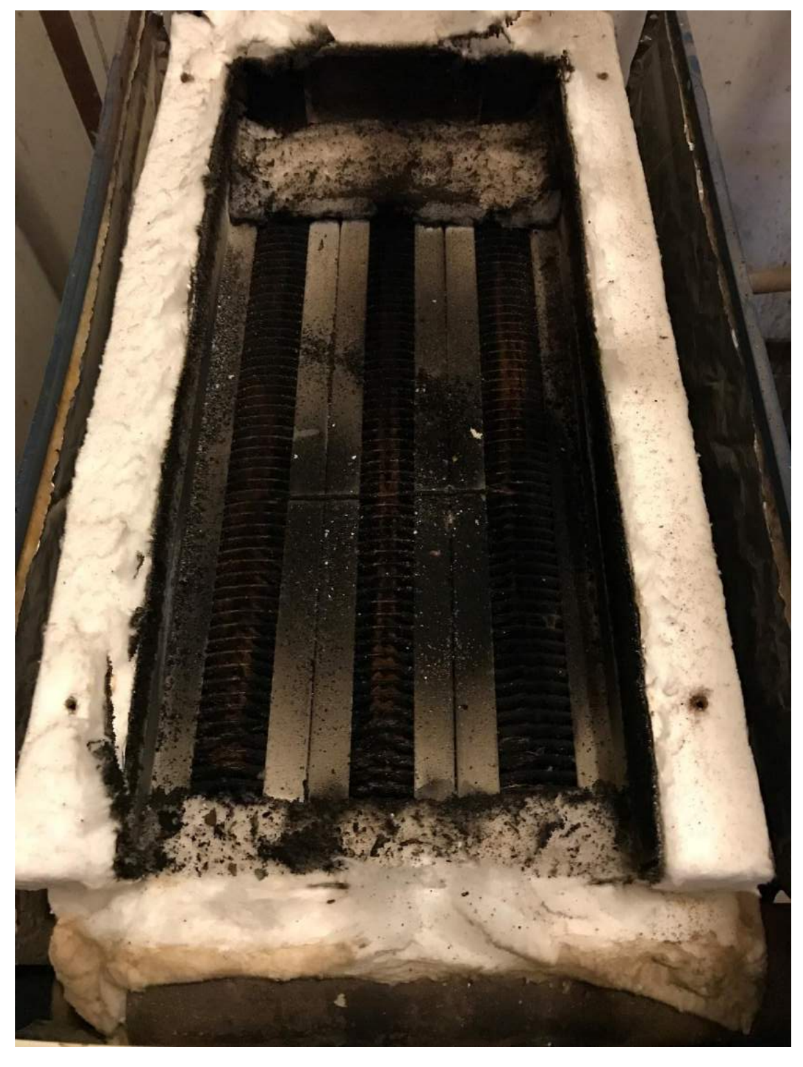
Figure 6: Boiler heat exchanger showing heavy sooting. (Please note: Some of this black soot may be from the fire)