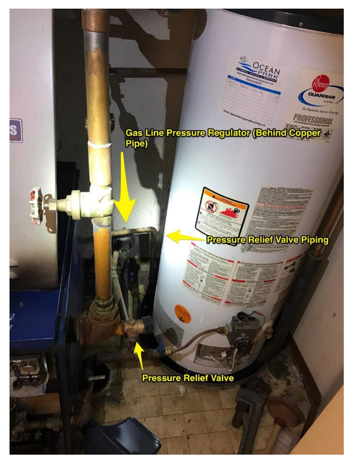
Figure 4: Pressure relief piping, and gas line pressure regulator.