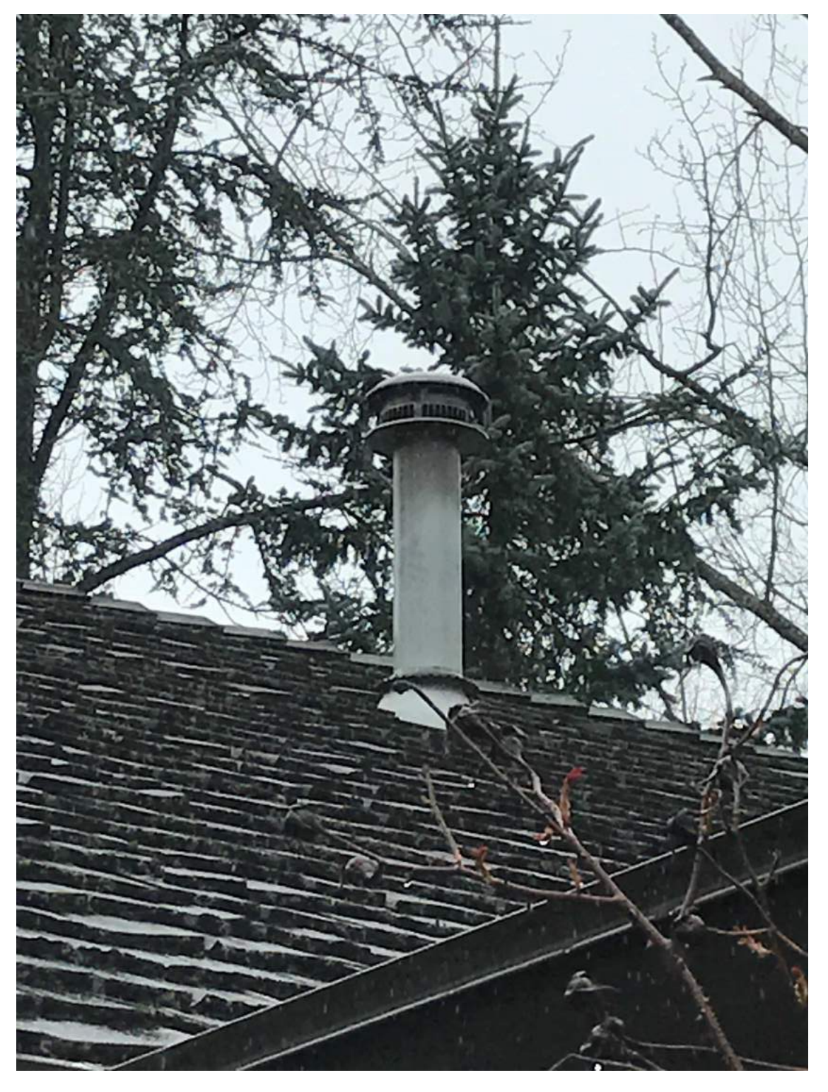
Figure 7: Roof termination for boiler, showing sooting beyond what would be expected from this type of appliance if it were burning properly.