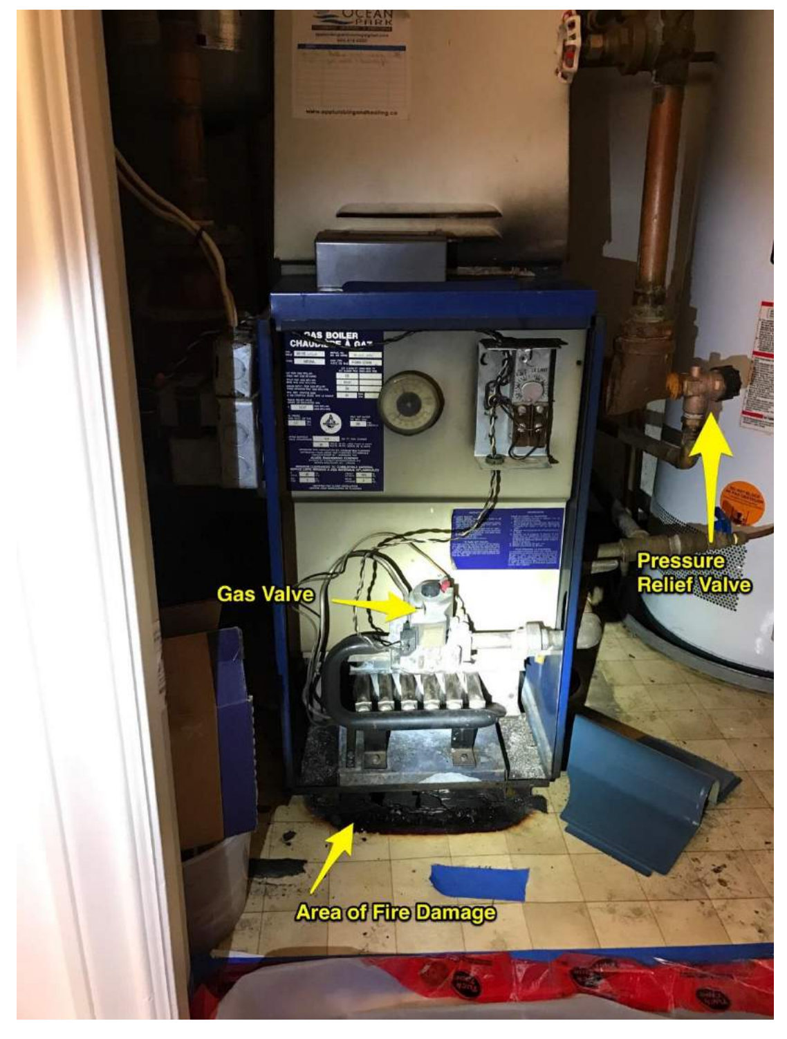
Figure 3: Front of boiler annotated to show components and fire damage.