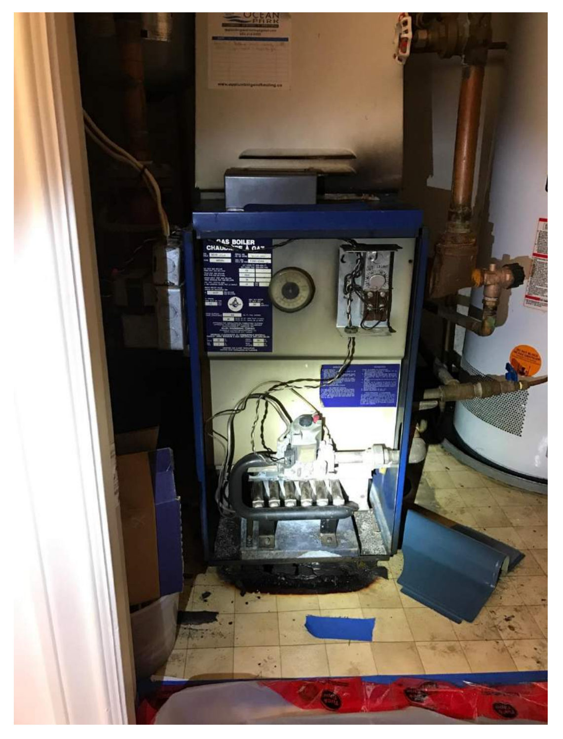
Figure 1: Front of boiler after fire.