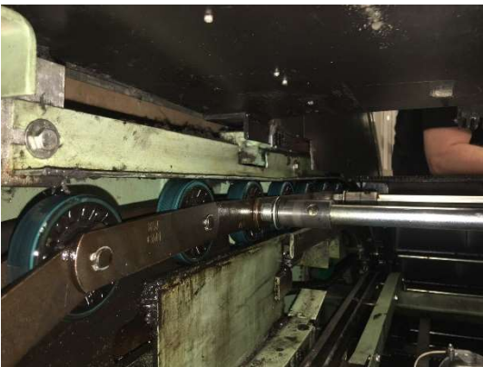
Step chain retainer track.