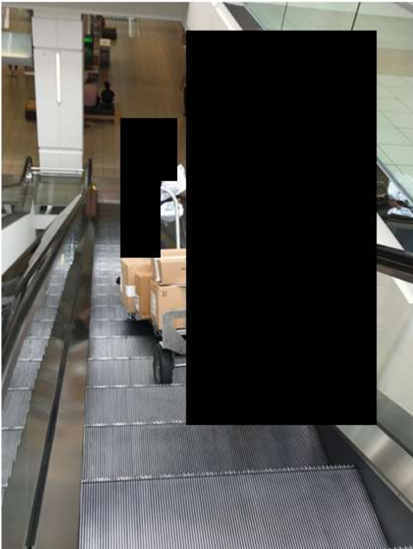
Freight being transported on escalator.