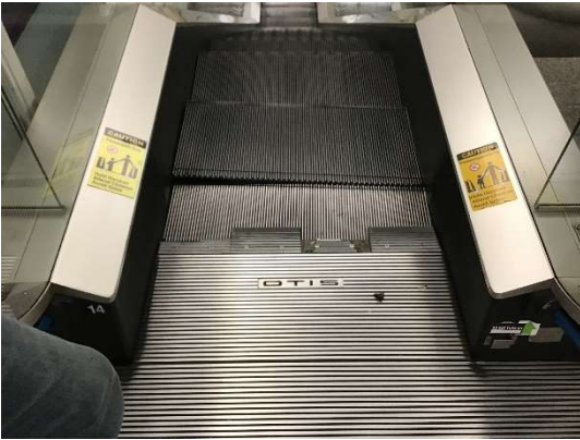
Damage to steps and combplate section.