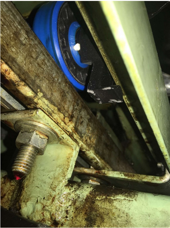
Upthrust track after adjustment.