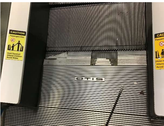
Damaged combplate sections.