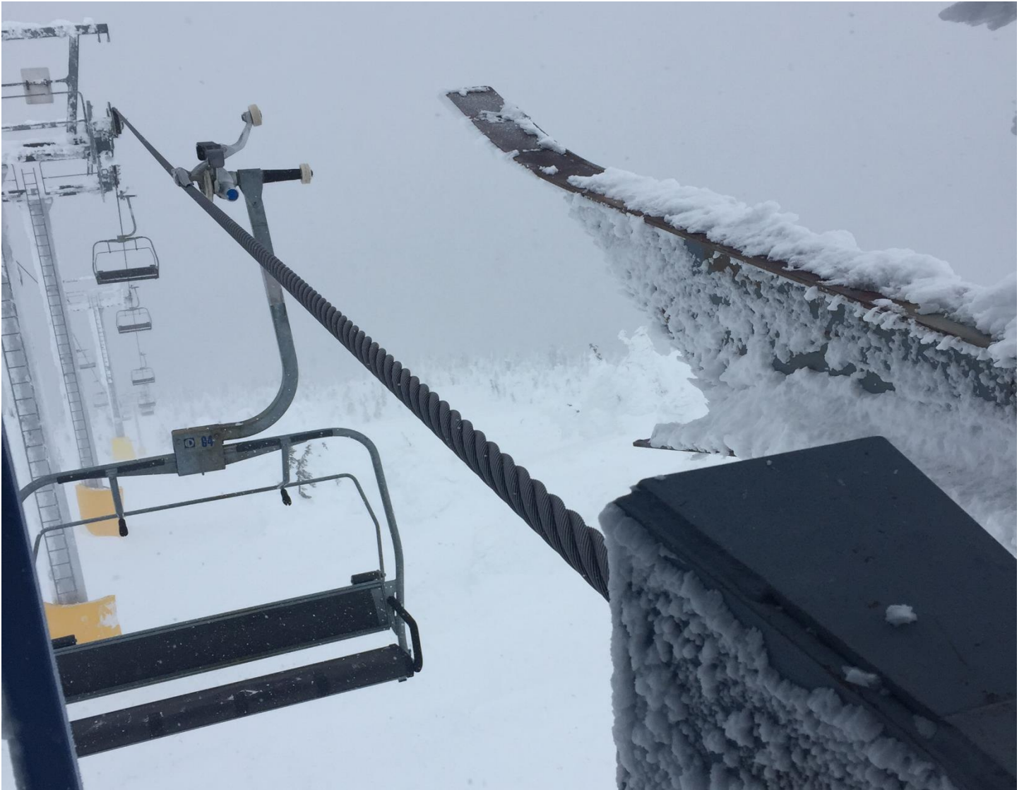
Carrier approaching Terminal entrance