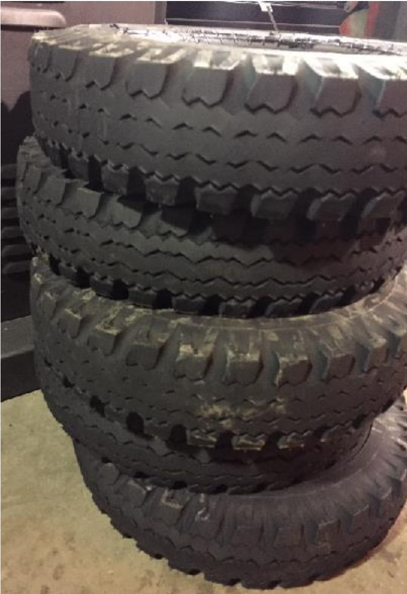
Replaced conveyance rubber tires