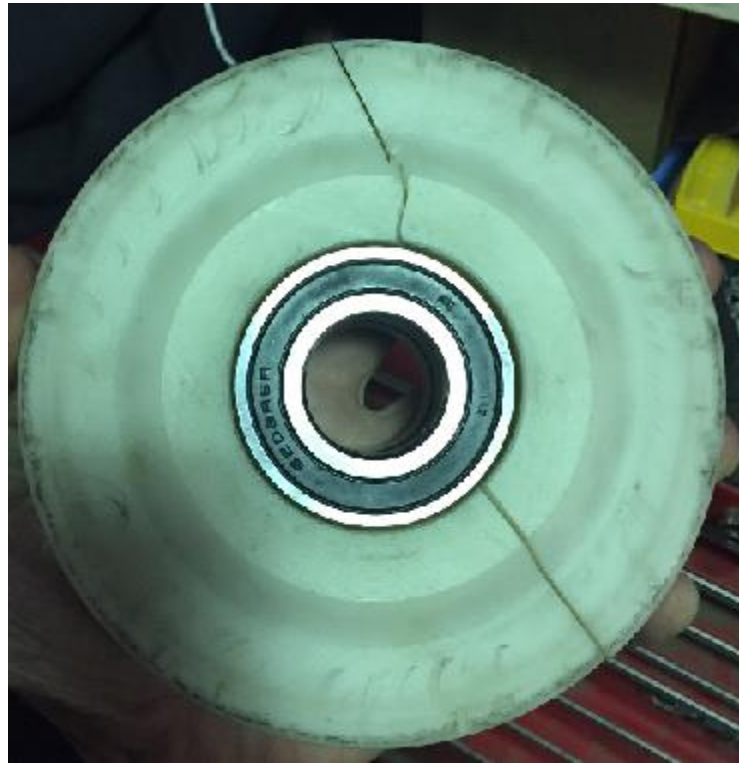
Ruptured grip rolling element