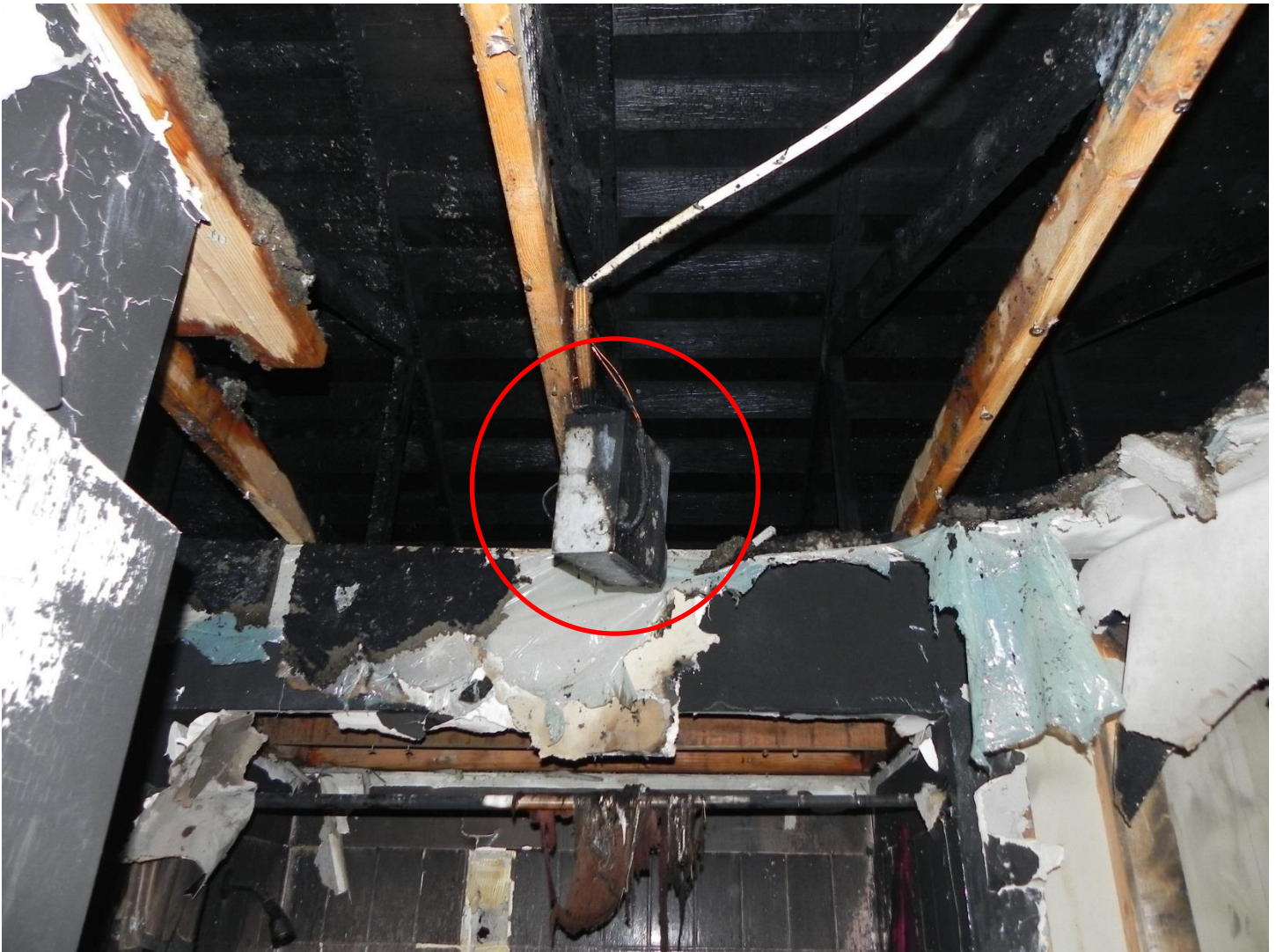
Figure 3 –Origin of the dwelling fire. Bathroom exhaust fan is suspended from a non-metallic sheathed cable branch circuit.