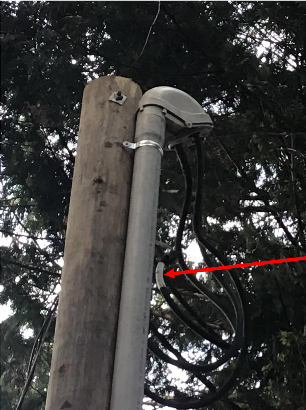
Figure 2 –Location where dwelling service conductors were incorrectly terminated to the overhead line conductors from the utility transformer. The red arrow shows the service neutral conductor that was incorrectly identified with white tape by the installer. This caused the utility to re-energize an ungrounded line conductor that was terminated to the dwelling's service neutral conductor which caused the over voltage condition at the bathroom exhaust fan within the dwelling.