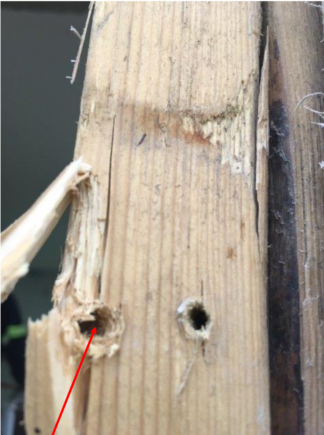
Location of anchoring point