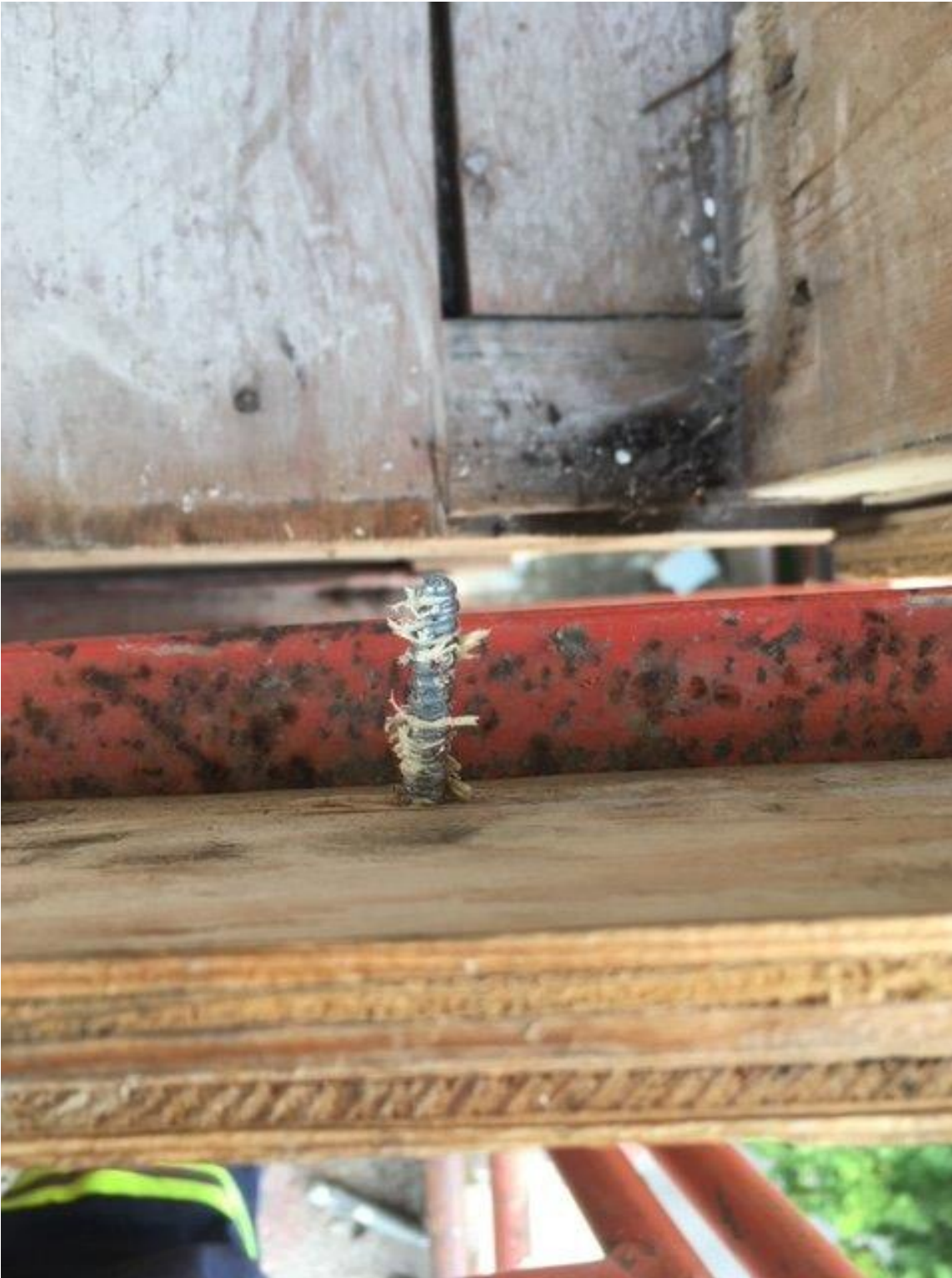
Lag screw used