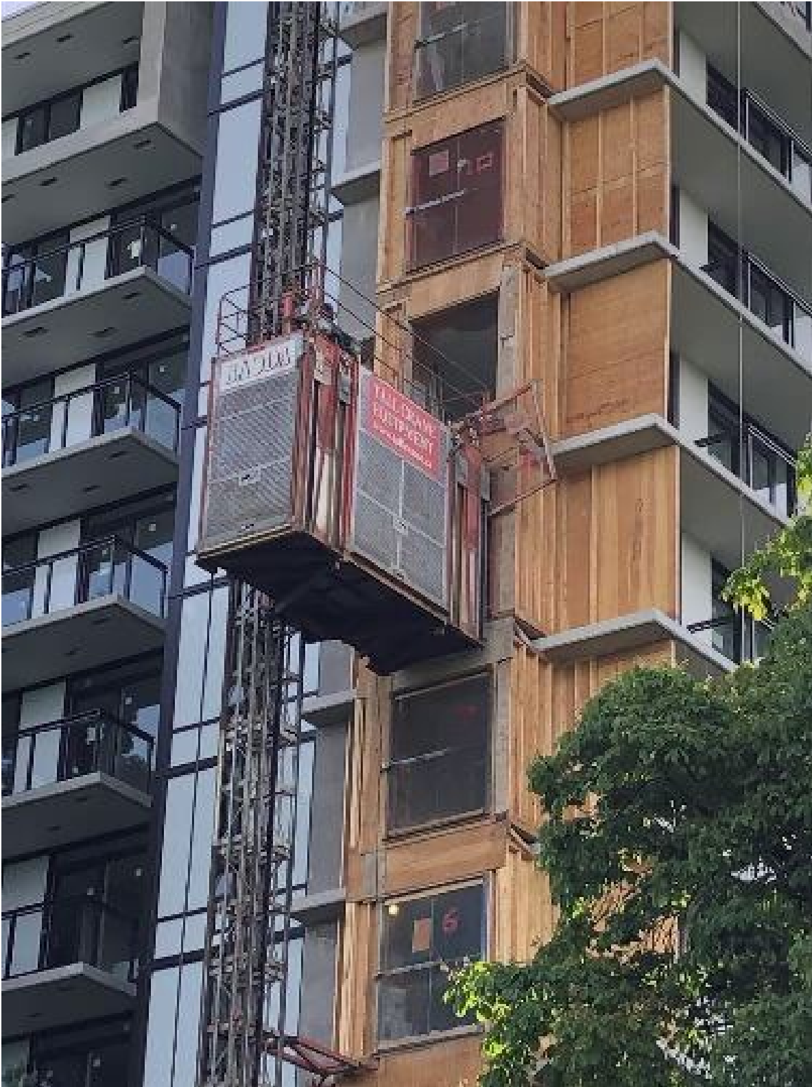
Gate dislodged from hoarding