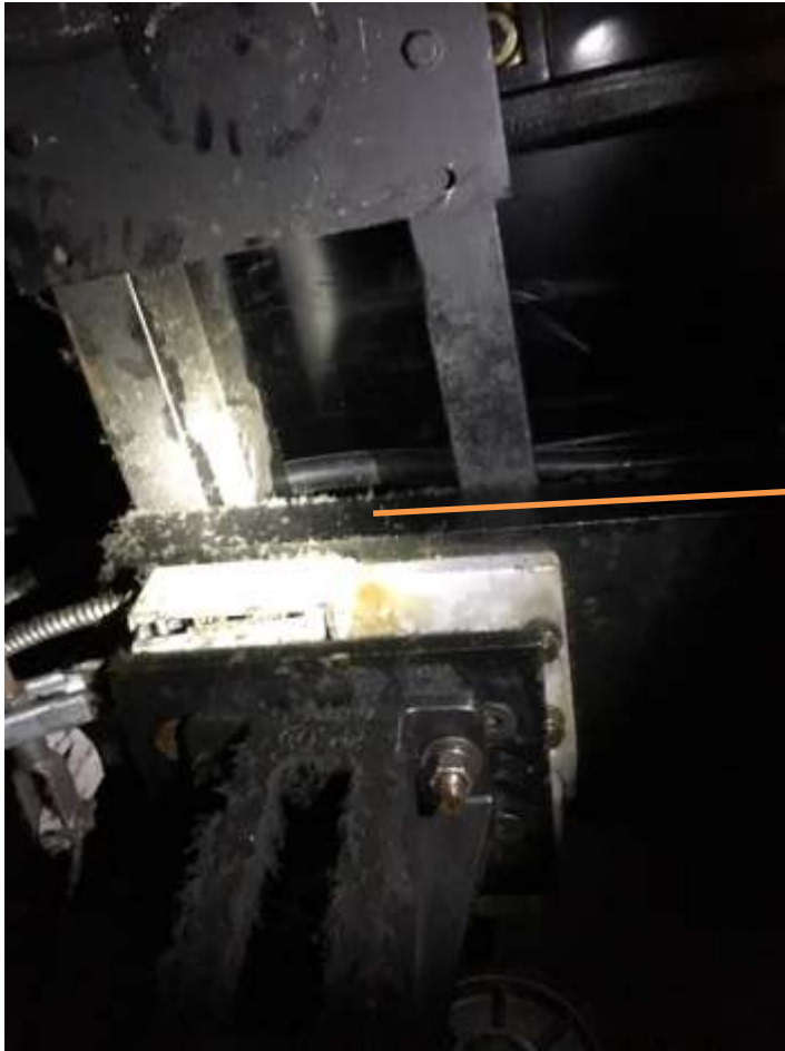
Misaligned Hitch Plate