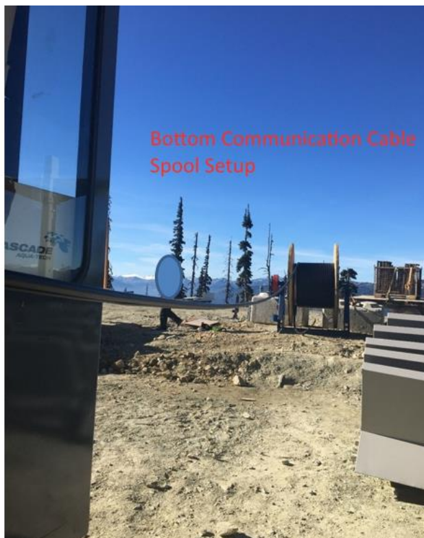
Figure 1: (Looking Down From Bottom Station)