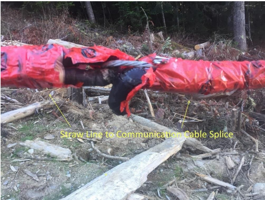
Figure 2: Straw Line to Communication Cable Splice