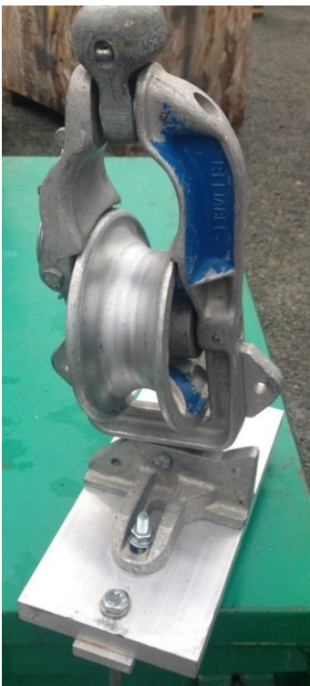
Figure 3: Roller Stringing Block