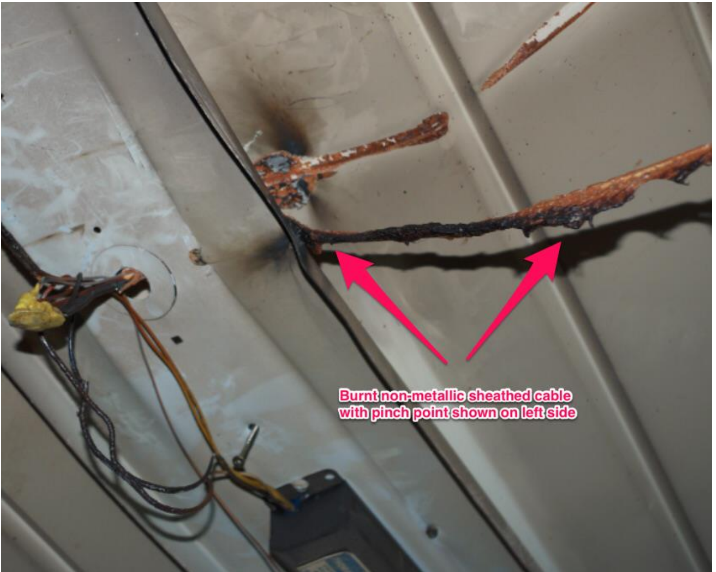
View #1 of melted damaged NMSC