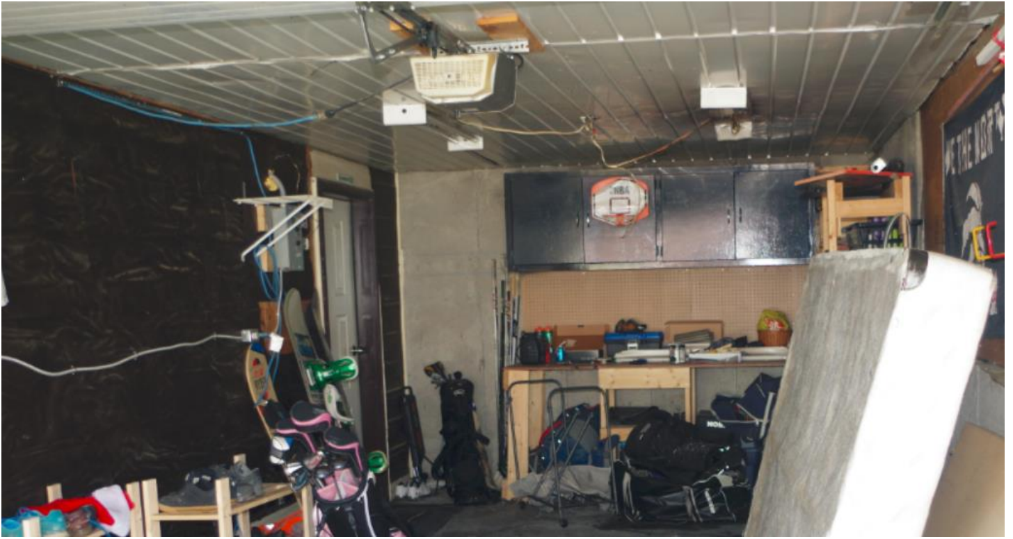
General interior view of garage