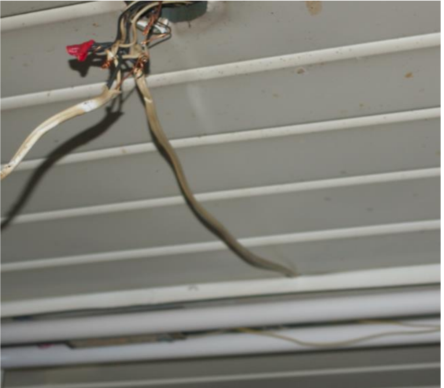
Connection of 2x ceiling mounted surface mounted lights to 'original' existing ceiling light junction box