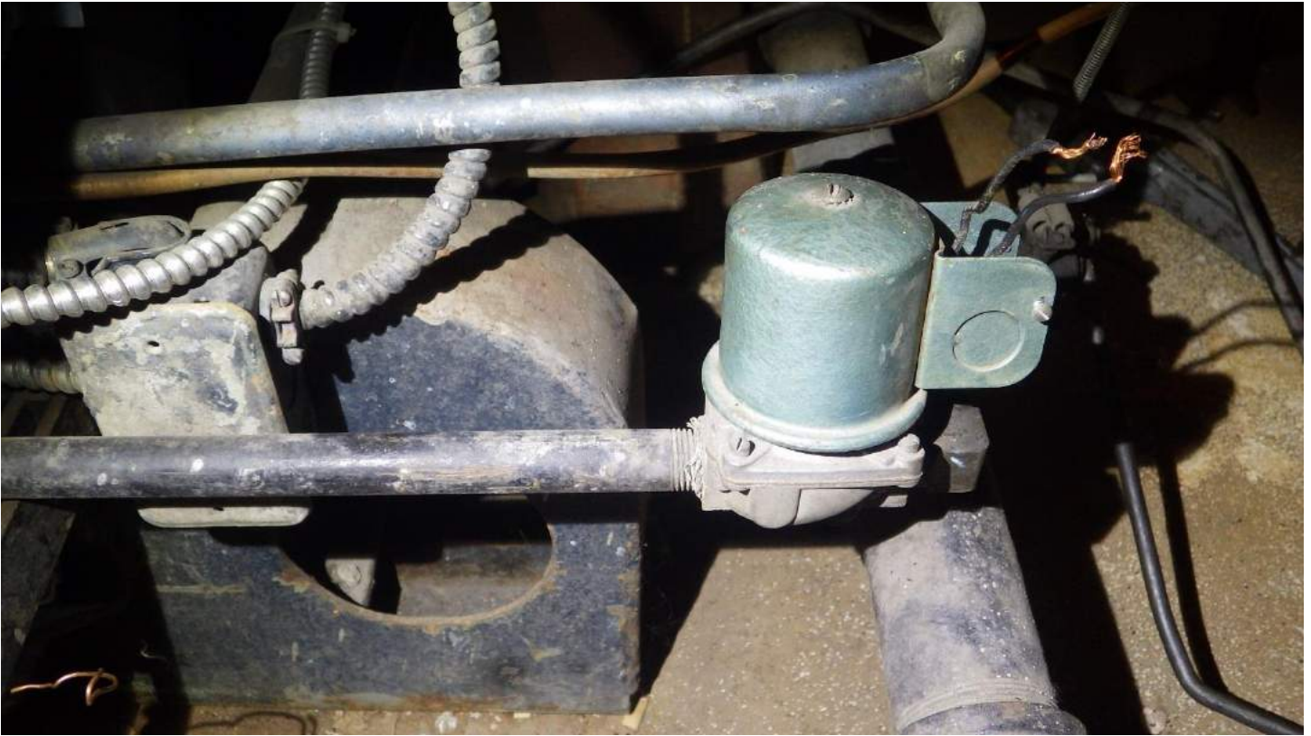
Solenoid operated pilot gas valve, still attached to supply line.