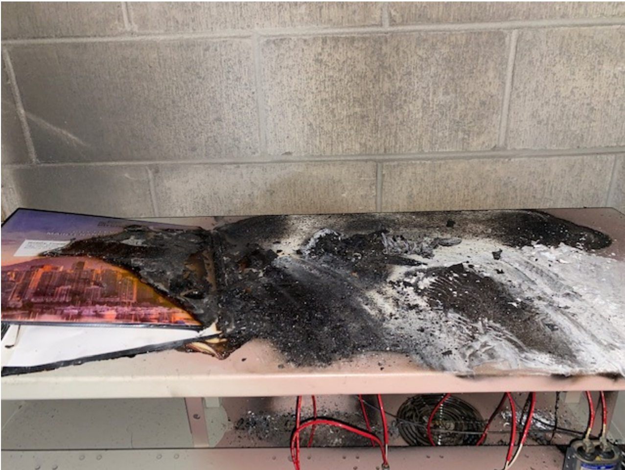
Image 1: Log Book, MCP Manual, schematics and documents were directly above the regenerative resistors

It is almost certain that heat was created by the regenerative resistors overheating, due to a fault caused by the variable frequency drive. It is probable that the maintenance manuals and documents caught on fire due to being placed on top of the controller cabinet directly over the regenerative resistors. The investigation was unable to determine the cause of the variable frequency drive overheating.