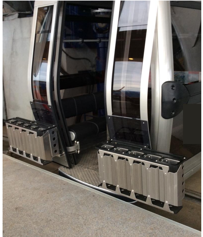
Example of Cabin Entrance