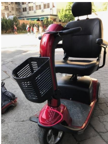
Motorized Mobility Scooter