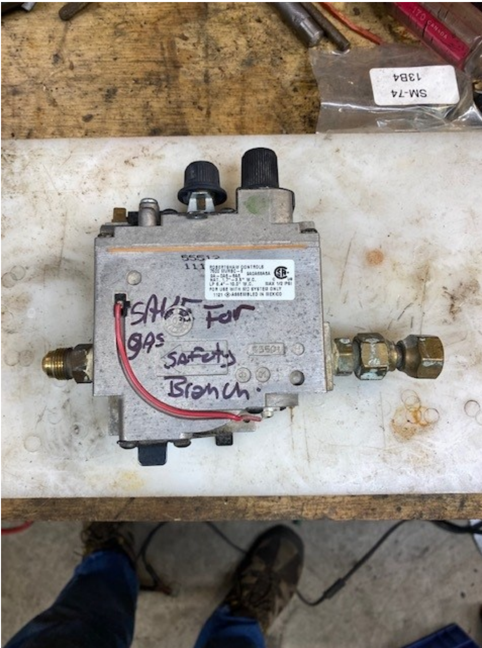
Image 4 - The original gas valve as provided to Technical Safety BC by the contractor who repaired the fireplace.