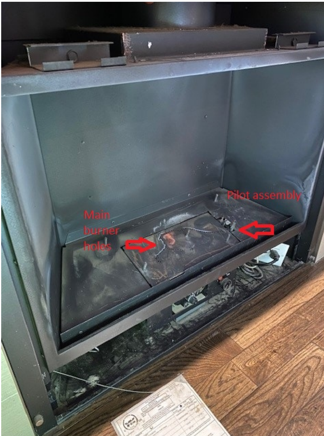
Image 1 - The condition of the fireplace at the time of inspection. The homeowner had removed the fireplace logs and had vacuumed up the glass on the floor and interior of the fireplace before inspection.