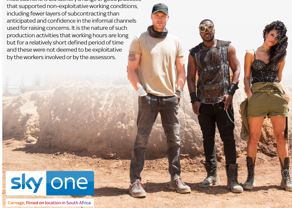
Carnage, filmed on location in South Africa

In 2017, we became a founding member of the TV and Human Rights Working Group , contributing to a modern slavery tool for independent production companies and sharing data with other working group members to better understand potential risks in programme-making. As the current Chair, Sky has agreed to jointly fund work to develop human rights guidance for the TV production industry.