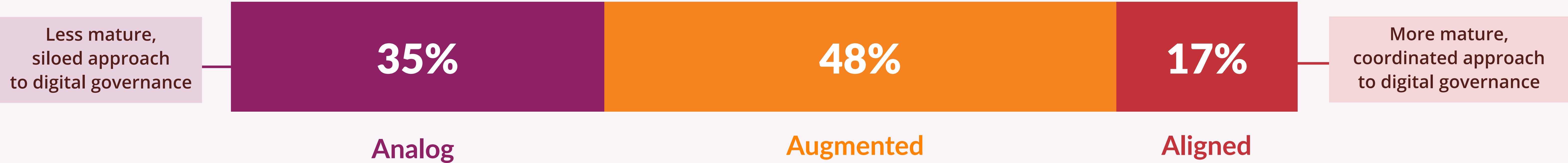
Maturity of organizational digital governance

Organizations are responding to the complexity, risks, and opportunities of digital governance by maturing their functions.