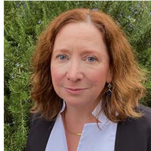
Regulator at Privacy Protection Agency State of Toyin