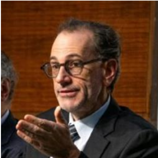
Our Narrator and Guide