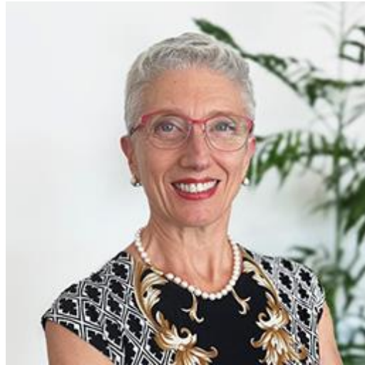
CPO of Babubu – E-commerce Platform