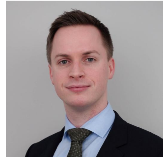
Cian O'Brien Deputy Data Protection Commissioner Data Protection Commission Ireland