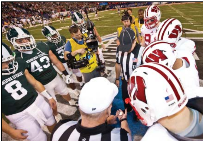
Michigan State and Wisconsin meet for the pregame coin toss in the inaugural Big Ten Championship Game.