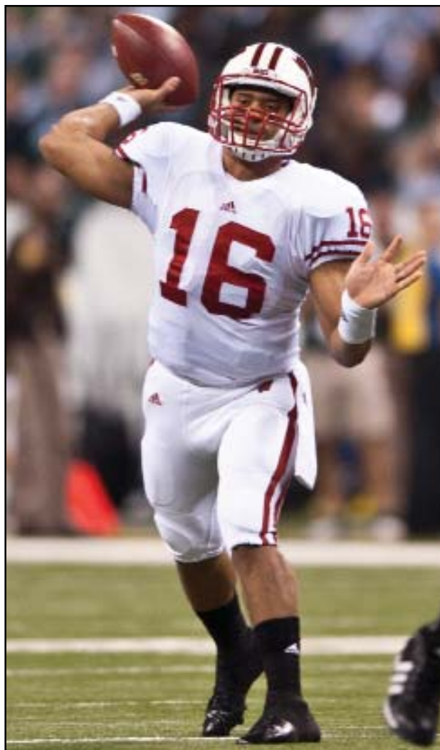
Wisconsin quarterback Russell Wilson was named the Grange-Griffin Championship Game MVP after throwing three touchdown passes in leading the Badgers to a 42-39 win over Michigan State in the inaugural Big Ten Championship Game.