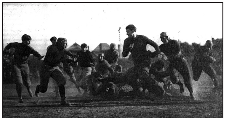
Michigan defeated Stanford in the inaugural Rose Bowl Game on Jan. 1, 1902.

The Rose Bowl Game and the Tournament of Roses have long provided a platform for countless memorable moments for student-athletes, coaches and fans alike, and have been enduring models of passion, strength, tradition and honor. Through more than 100 games, the Rose Bowl Game has sustained its standard of excellence, living up to its nickname as "The Granddaddy of Them All."