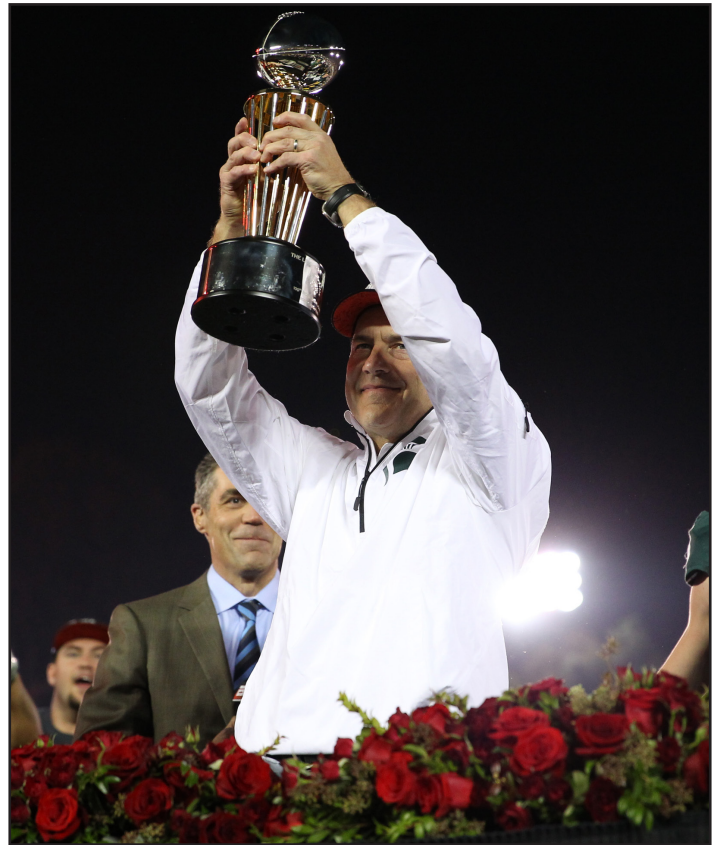
Michigan State defeated Stanford in the 100th Rose Bowl Game on Jan. 1, 2014.

The Rose Bowl Game was the first college football game to be broadcast nationally in 1952 and the first to be broadcast in color in 1962. It was also the first game to be broadcast by satellite to Europe in 1968 and to the Far East in 1978. The union of the Big Ten and Pac-12 also led to soaring attendance. Prior to 1947, the Rose Bowl Game drew a small number of sellout crowds. Every game since has been a sellout, and in 1950 became the first postseason contest to surpass 100,000 fans in attendance. Since the pact was initiated in 1946, the Pac-12 holds a narrow 35-30 advantage.