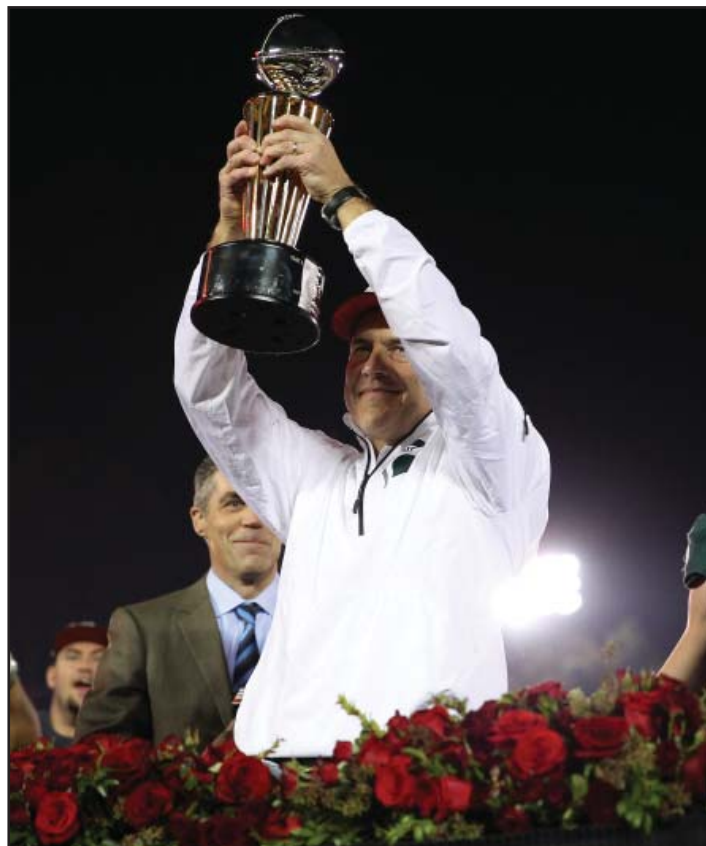
Michigan State defeated Stanford in the 100th Rose Bowl Game on Jan. 1, 2014.

The Rose Bowl Game was the nation's first bowl game, with Michigan earning a victory in the inaugural event in 1902, and has been a pioneer in college football history. The game became the first sporting event to feature a coast-to-coast ra-