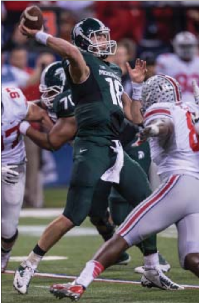
Michigan State quarterback Connor Cook threw for a Big Ten Championship Game record 304 yards and three touchdowns in leading the Spartans to a 34-24 victory over Ohio State in the 2013 Big Ten Football Championship Game. Cook was named the Grange-Griffin Championship Game MVP.