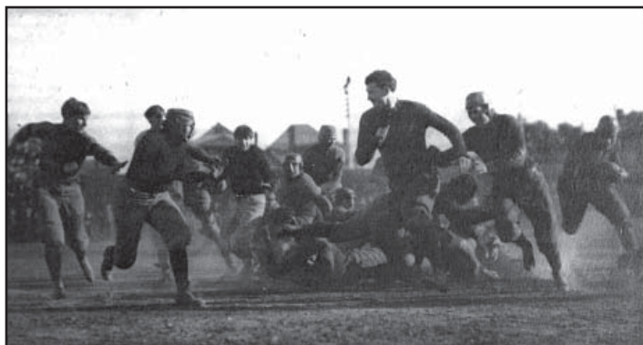
Michigan defeated Stanford in the inaugural Rose Bowl Game on Jan. 1, 1902.

The Rose Bowl Game and the Tournament of Roses have long provided a platform for countless memorable moments for student-athletes, coaches and fans alike, and have been enduring models of passion, strength, tradition and honor. Over 100 games, the Rose Bowl Game has sustained its standard of excellence, living up to its nickname "The Granddaddy of Them All."