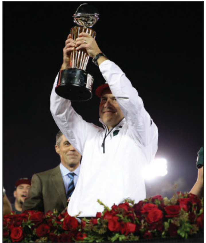
Michigan State defeated Stanford in the 100th Rose Bowl Game on Jan. 1, 2014.

The Rose Bowl Game was the nation's first bowl game, with Michigan earning a victory in the inaugural event in 1902, and has been a pioneer in college football history. The game became the first sporting event to feature a coast-to-coast radio broadcast in 1927. The Pacific Coast (now the Pac-12) and Western (Big Ten) Conferences, along with the Pasadena Tournament of Roses Association, agreed