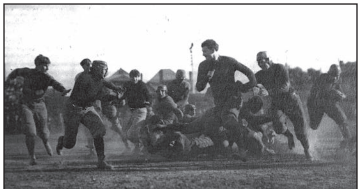
Michigan defeated Stanford in the inaugural Rose Bowl Game on Jan. 1, 1902.