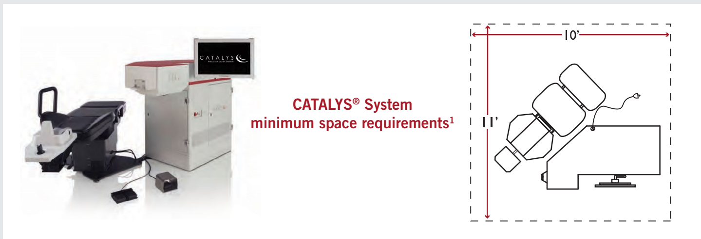
CATALYS® System minimum space requirements 1

Reference: 1. Operator Manual for the CATALYS® Precision Laser System. Milpitas, Calif.; AMO Manufacturing.