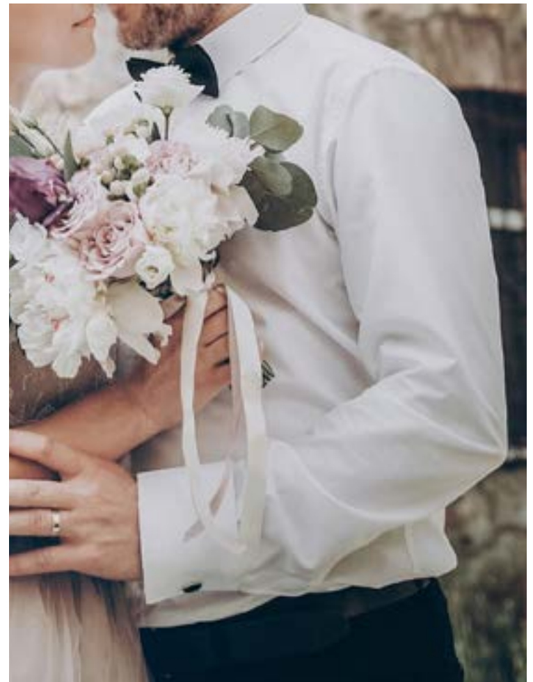
BELLAGIO WEDDING CHAPEL