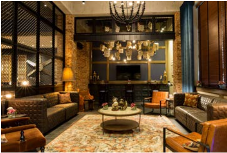
BOARDROOMS AND BREAKOUT SPACES