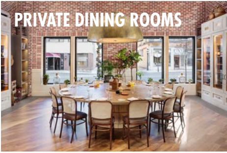
PRIVATE DINING ROOMS