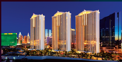
THE SIGNATURE at MGM GRAND