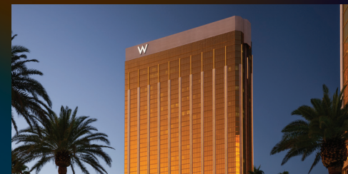
W LAS VEGAS