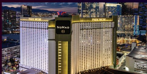
PARK MGM and NOMAD LAS VEGAS