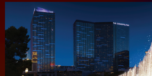
THE COSMOPOLITAN OF LAS VEGAS