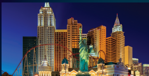
NEW YORK-NEW YORK