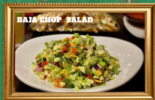
BAJA CHOP SALAD