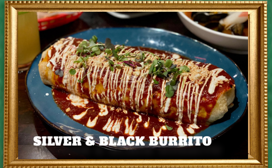
SILVER & BLACK BURRITO

Grilled Poblano Pepper, Stuffed with Chopped Steak A La Mexicana, Mexican Cheese Blend, Sour Cream, Guacamole, Crispy Tostada, Guajillo Sauce, Rice, Refried Beans $19.95