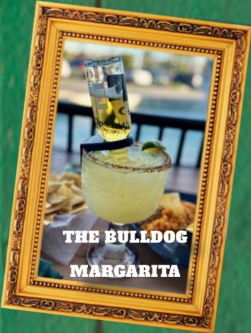
THE BULLDOG MARGARITA