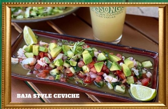
BAJA STYLE CEVICHE