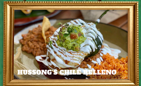
HUSSONG'S CHILE RELLENO