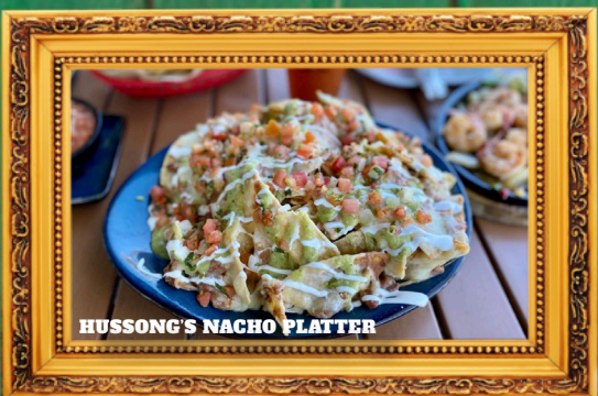
HUSSONG'S NACHO PLATTER