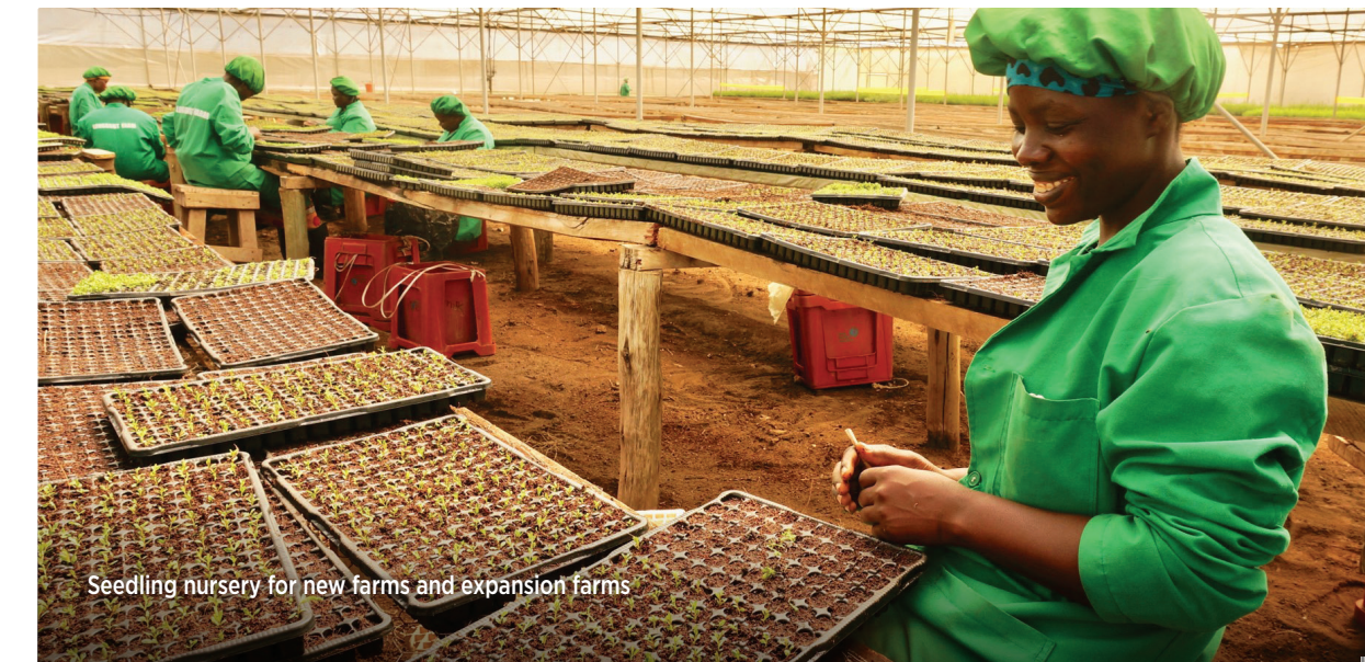
Seedling nursery for new farms and expansion farms

In addition to the production of essential oils, Fairoils is a large producer of pure and natural vegetable oils for the cosmetic and personal care industry. They produce an extensive list of vegetable oils including Sesame, Avocado, Macadamia Nut, Tamanu, Pomegranate Seed, Moringa, Shea, and Baobab. The plants are grown and harvested by smallholder farmers from all over Kenya, Uganda, Madagascar, and Sudan, and are brought to the Athi River Facility where the seeds (or nuts) are pressed, blended, and then exported to customers in the cosmetics industry. dōTERRA intends to utilize many of these exciting carrier oils in future products.