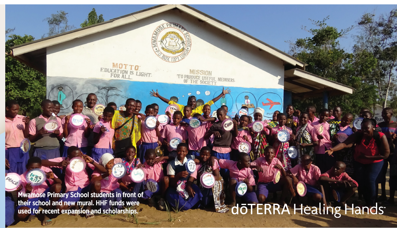
Mwamose Primary School students in front of their school and new mural. HHF funds were used for recent expansion and scholarships. dōTERRA Healing Hands

Establishment of a Community Development Fund. For every kilogram of oil produced by our farmer cooperatives, a portion of that revenue will be set aside in a fund overseen by the cooperatives themselves to finance larger development projects at their discretion. These funds are in addition to the generous donations made by the dōTERRA Healing Hands Foundation™.