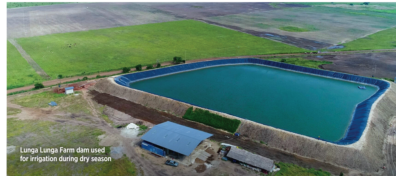
Lunga Lunga Farm dam used for irrigation during dry season

commercial farm, with field officers working closely with smallholder farmers to ensure quality, improve yields, and maximize incomes for their crops.