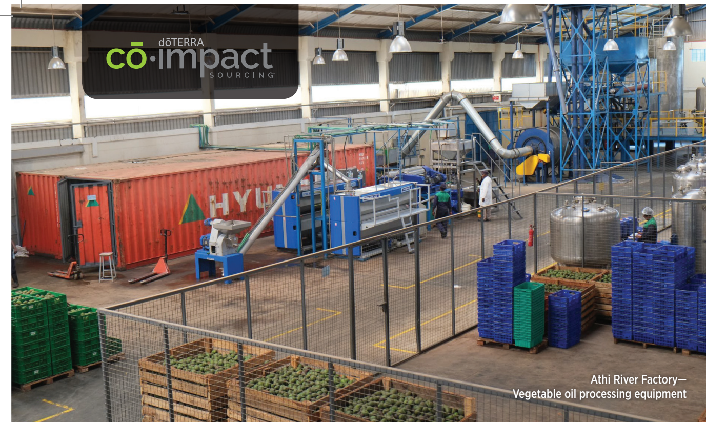
Athi River Factory— Vegetable oil processing equipment