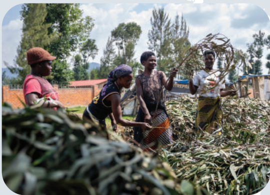
Eucalyptus in Rwanda