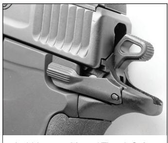
Ambidextrous Manual Thumb Safety