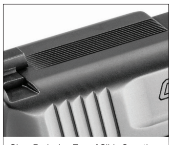
Glare Reducing Top of Slide Serrations