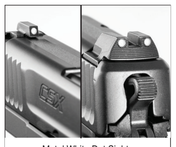
Metal White Dot Sights