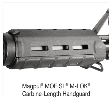
Magpul® MOE SL® M-LOK® Carbine-Length Handguard