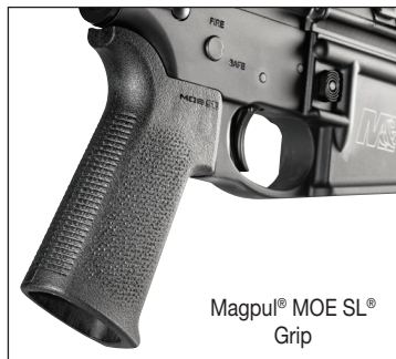
Magpul® MOE SL® Grip