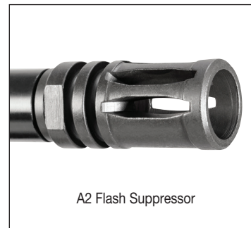
A2 Flash Suppressor