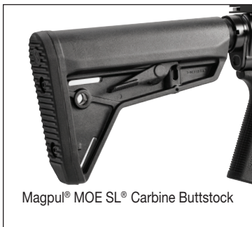
Magpul® MOE SL® Carbine Buttstock

Armornite® finish is a hardened nitride finish that provides enhanced corrosion resistance, greatly improved wear resistance, decreased surface roughness, reduced light reflection and increased surface lubricity. Armornite is used on many S&W® and M&P® products imparting a high level of protection internally and externally where applied.