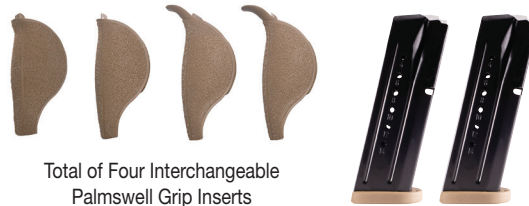
Total of Four Interchangeable Palmwell Grip Inserts

Two - 15-Round 9mm Magazines Included SKU: 3011957 UPC Code: 022188881479