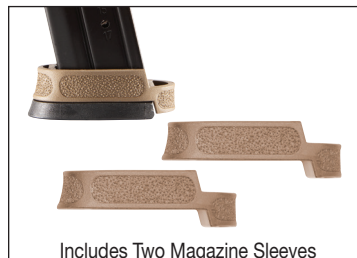
Includes Two Magazine Sleeves for Use with a 17-Round Full Size Magazine