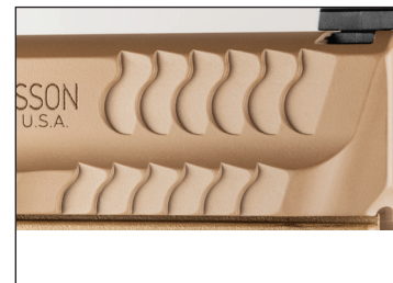
Forward Slide Serrations