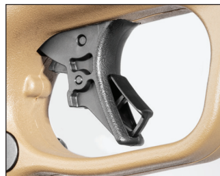
M2.0 Flat Face Trigger