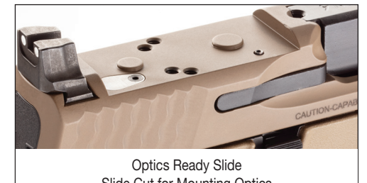
Optics Ready Slide Slide Cut for Mounting Optics Accepts Crimson Trace®, Trijicon®, Leupold® Delta Point Pro, J-Point, Docter, C-MORE, Insight® and Nikon