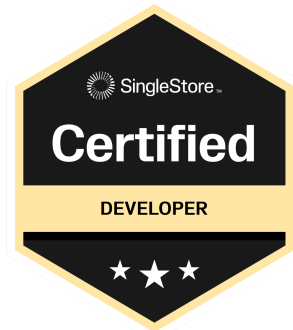
SingleStore Certified Developer Badge

Candidates who pass this exam receive SingleStore Certified Developer certification. This certification is active for one year.